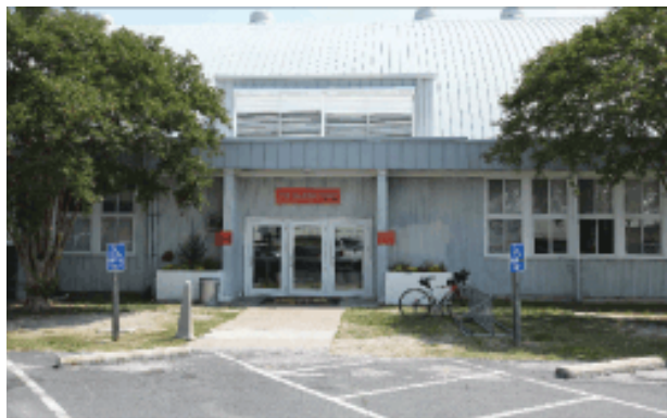
Cherry Point Marine Dome (Pet Friendly) : Bldg. 287 (252) 466-2566