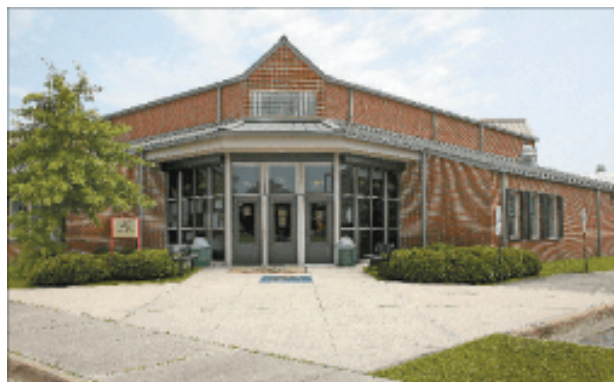
Cherry Tree House: Bldg. 4415 "C" Street (252) 466-3769