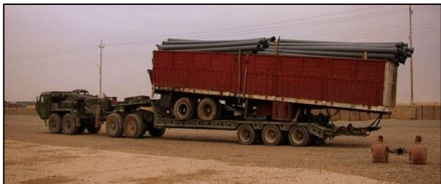
LVS MK48/16/870A2 in Camp Fallujah, Iraq. Carrying an insurgent damaged semi-trailer.

According to the 2011 Urgent Universal Need Statement (UUNS) submitted by I Marine Expeditionary Force (Forward (I MEF (FWD))), the primary flaw of the 870 trailer involved failure of the tires, rims, axles, U-bolt assemblies, and suspension air bags. As failures occurred, operating characteristics of the trailer would change. These changing characteristics resulted in shifting loads, further exacerbating extant failures, leading to additional damage to the trailers.