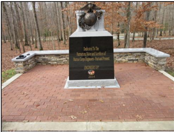
MCEA Engineer Monument

The picture of our MCEA monument at the National Museum of OUR Marine Corps shows the recently installed bricks.