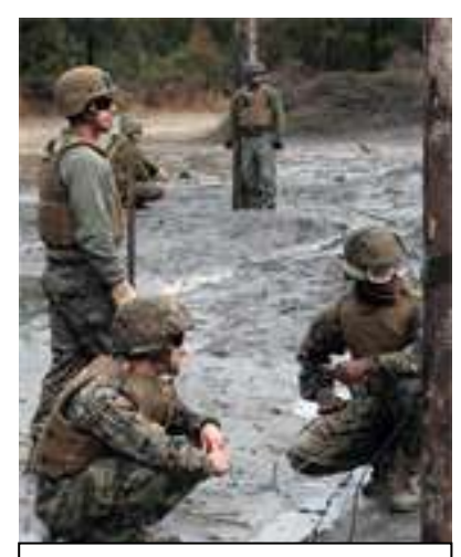
Marines with the units set explosives in a tree, a part of a timber charge that can be used to clear trees to make a path.