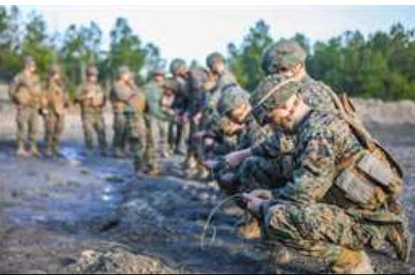
Marines prepare a ditching shot, January 10 at Engineer Training Area 3, under the supervision of an instructor to ensure safety for the Marines and that the charge is properly put together. Marines practiced the basics before moving on to other portions of the range. Practicing the basics is what allows for them to build on and advance in their knowledge of different explosives and their many uses.

dirt, which rained down onto the Marines waiting to rush the building. January 10 was the day Marines waited for. After three days of classes and one day of rehearsals, junior Marines were able to get hands-on training with live explosives at Engineer Training Area 3. The engineers work diligently in preparation to support infantry units for