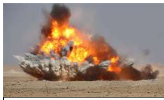
A cratering charge detonates when Marines assigned to Engr Det, CLB 15, 15th MEU, conducted a controlled detonation exercise at a live-fire range near Camp Buehring, Kuwait, during a routine training exercise, Nov. 25.

With the use of shape and cratering charges and C-4, the combat engineers demonstrated practical applications of the explosives they use in combat environments.