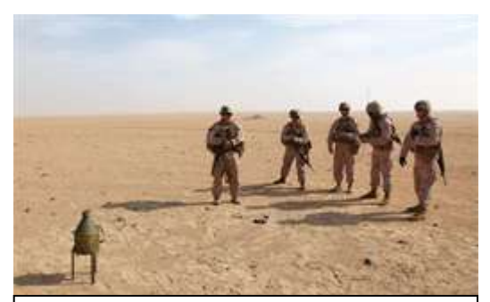
Marines assigned to Engr Det, CLB 15, 15th MEU, light a fuse for a shape charge for a controlled detonation at a live-fire range near Camp Buehring, Kuwait, during a routine training exercise, Nov. 25.

Combat engineers rarely get the chance to use explosives in training, and sometimes are only able to visit a demolition range twice a year. Practical application is an important, yet inherently dangerous, part of their job they take very seriously.