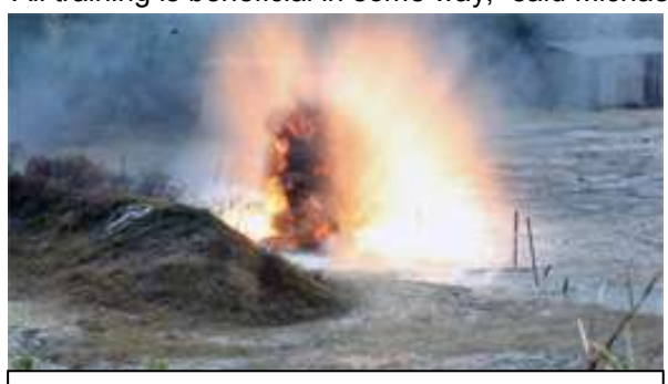
A manufactured Bangalore torpedo explodes clearing a path through concertina wire.