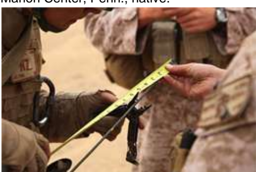
Marines assigned to Engr Det, CLB 15, 15th MEU, measure and cut a fuse to use for a controlled detonation at a live-fire range near Camp Buehring, Kuwait, during a routine training exercise, Nov. 25.