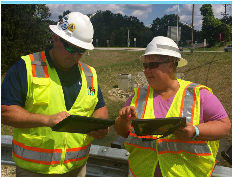
Construction partnering and electronic documentation are two means of connecting stakeholders to improve collaboration and project delivery.

Construction partnering is a project management practice where transportation agencies, contractors, and other stakeholders create a team relationship of mutual trust and improved communications. Partnering builds relationships and connections among stakeholders to improve outcomes and successful completion of quality projects that are built on time and within budget, focused on safety, and profitable for contractors.