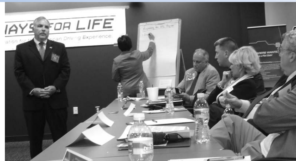
Stakeholders provided feedback on the Highways for LIFE program at a meeting at Turner-Fairbank Highway Research Center.