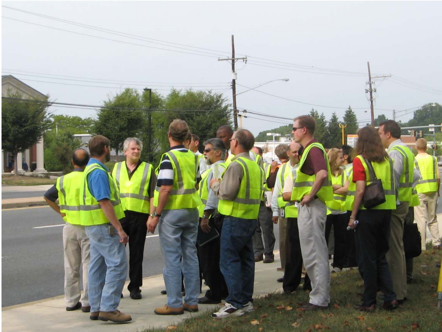
Photo 1: ACTT Workshop Team meets at Intersection of MD-97 and Randolph Rd