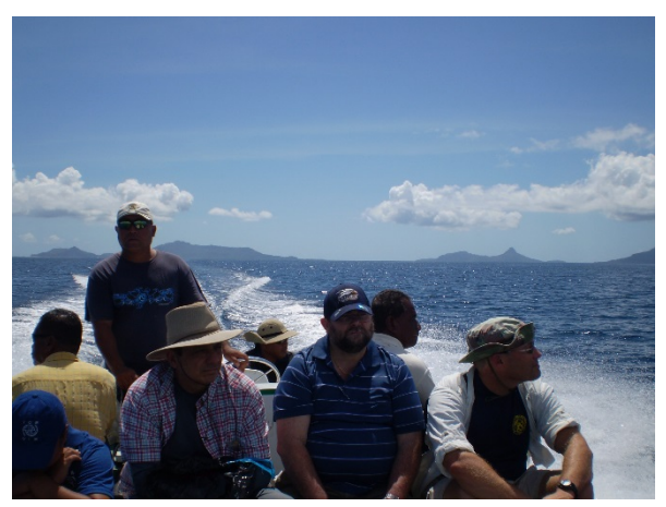
PDA teams on Chuuk Lagoon.

From March 29 to April 2, 2015, Typhoon Maysak crossed over FSM's Chuuk and Yap states with strong winds and heavy rains, affecting approximately 29,000 people. In affected areas of Chuuk—particularly islands in Chuuk Lagoon—the storm destroyed up to 90 percent of crops, banana plants and fruit trees; completely destroyed 186 homes; resulted in damages to public infrastructure; and significantly damaged residential rainwater catchment systems. FEMA provided two teams to participate in joint preliminary damage assessments (PDA) with USAID/OFDA and officials from the Federated States of Micronesia, Chuuk State and Yap State. The PDAs were the basis for the FSM President's request to President Obama for U.S. disaster assistance. On April 28, 2015, President Obama issued a Presidential Declaration, authorizing a Disaster Relief and Reconstruction program funded by FEMA and implemented under the Operational Blueprint by USAID/OFDA.