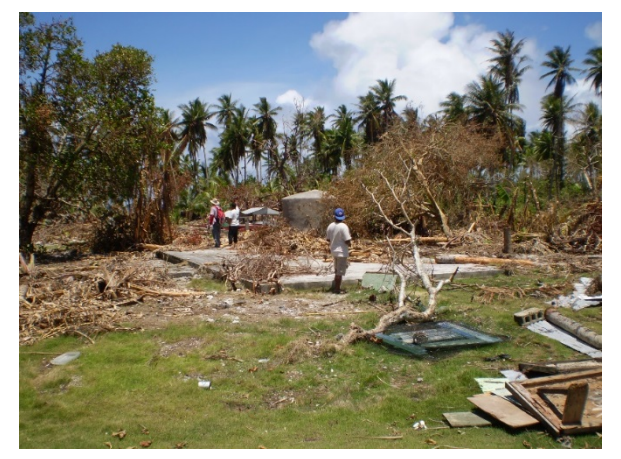
Typhoon Maysak destruction.