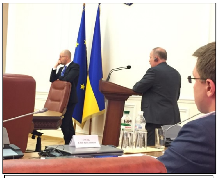
Ukraine Foreign Minister briefed by USG Inter- Agency Task Force

and Sustainability Plan, which focused on the provision of fuel and energy. Based on exercise results, the team developed an after-action report for TTX participants and the Prime Minister.