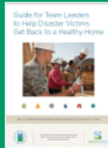
Guide for Team Leaders to Help Disaster Victims Get Back to a Healthy Home