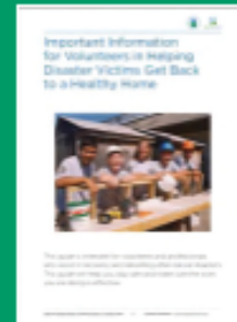
Important Information for Volunteers in Helping Disaster Victims Get Back to a Healthy Home