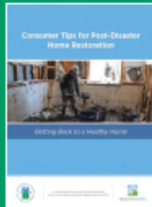
Consumer Tips for Post-Disaster Restoration – Getting Back to a Healthy Home