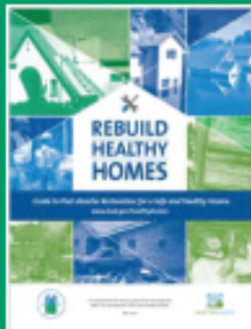
Rebuild Healthy Homes - A Guide to Post-Disaster Restoration for a Safe and Healthy Home