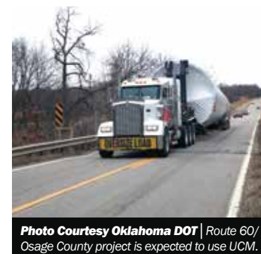
Route 60/Osage County project is expected to use UCM.

The Challenge: With the existing project development processes used by the Oklahoma Department of Transportation (ODOT), communication on utility conflicts only occurs at certain points between the Roadway Design Division and Utilities Branch (UB). At the project scoping stage, utilities are discussed with the representatives from design, right-of-way, and survey. At the 30-percent-design stage, the UB becomes involved with the project and determines if utilities will need to be relocated. The UB does not generally review the design again until 60 percent completion of the plans.