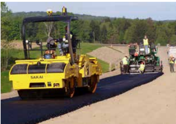
Top: Innovations funded by the 2013 Highways for LIFE program grants include use of the geosynthetic reinforced soil-integrated bridge system (GRS-IBS). The Bowman Road Bridge in Defiance County, OH, was the first bridge in the world to use GRS-IBS.