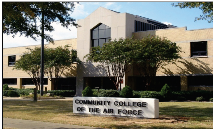
Ryan Hall, CCAF Administrative Center Maxwell AFB, Gunter Annex, Alabama

The administrative staff brings together all elements of the system under the matrix authority of Air Force Instruction 36-2648, Community College of the Air Force . The Community College of the Air Force was located at Randolph AFB, Texas, during 1 April 1972 - 15 January 1977; at Lackland AFB, Texas, during 16 January 1977 - 31 March 1979; at Maxwell AFB, Alabama, during 1 April 1979 - 4 November 2008; at Maxwell AFB, Gunter Annex, Alabama, since 5 November 2008.