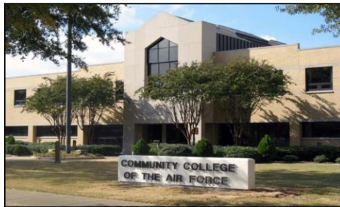
Ryan Hall, CCAF Administrative Center Maxwell AFB, Gunter Annex, Alabama

The administrative staff brings together all elements of the system under the matrix authority of Air Force Instruction 36-2648, Community College of the Air Force . The Community College of the Air Force was located at Randolph AFB, Texas, during 1 April 1972-15 January 1977; at Lackland AFB, Texas, during 16 January 1977-31 March 1979; at Maxwell AFB, Alabama, during 1 April 1979 – 4 November 2008; at Maxwell AFB, Gunter Annex, Alabama, since 5 November 2008.