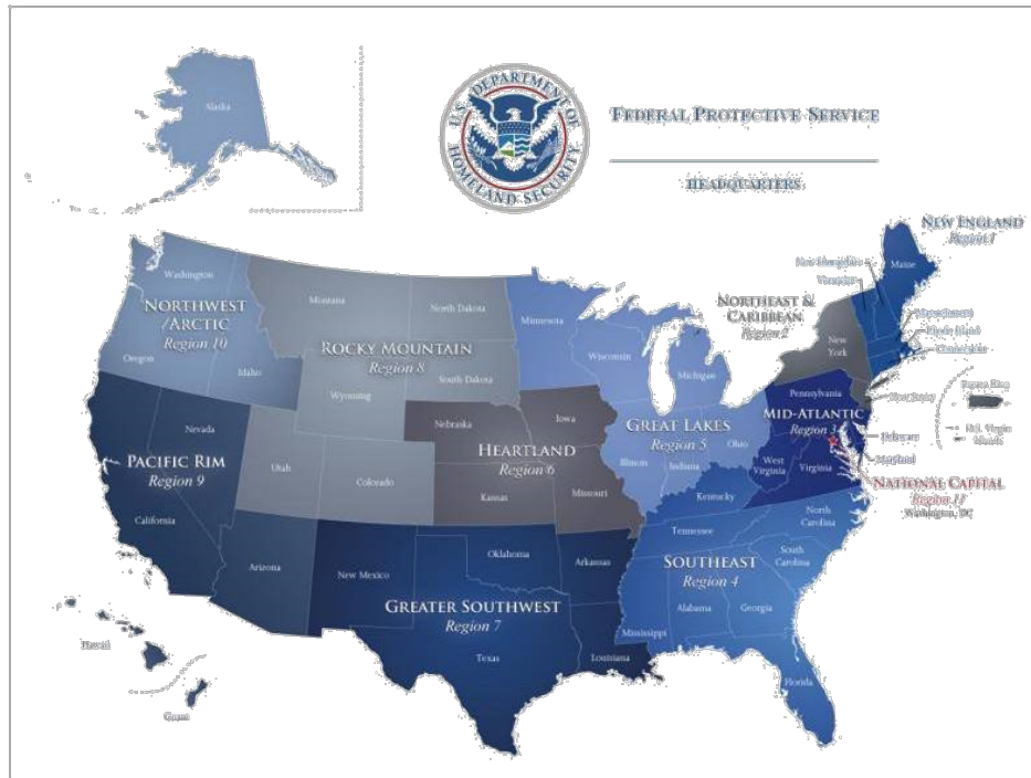
Figure 1. Organization of the Federal Protective Service

Currently, FPS is authorized 1,371 FTE. The workforce distribution for the staffing floor established by Congress is shown for headquarters and each region.