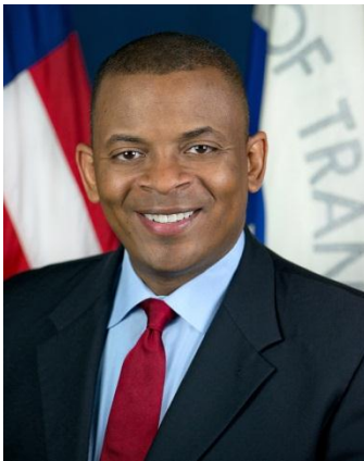
Secretary Anthony Foxx U.S. Department of Transportation

The United States Department of Transportation (USDOT) and the Corporation for National and Community Service (CNCS) have partnered to encourage the use of youth service and conservation corps to perform appropriate transportation related projects. This webinar will provide an overview of transportation youth workforce opportunities and highlight best practices.