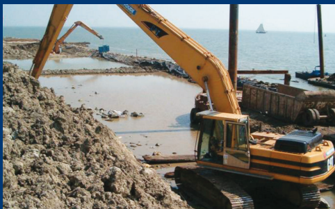
Levee construction.