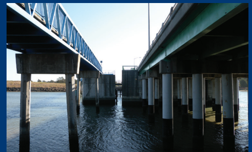
Bay Farm Island Bridge, Alameda.