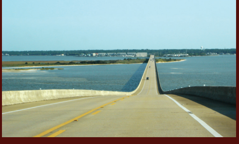
Dauphin Island Bridge in the Central Gulf Coast region.