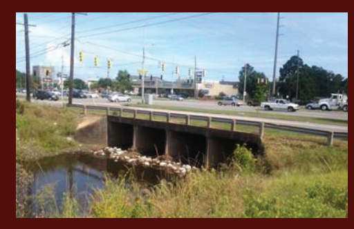
Airport Boulevard Culvert over Montlimar Creek in Mobile, Alabama.

Gather and process climate information. The project team developed climate information relevant to transportation planning to characterize plausible future climate scenarios in Mobile. Figure 1 summarizes the climate stressors, scenarios, and timeframes used for projecting future climate conditions in Mobile.