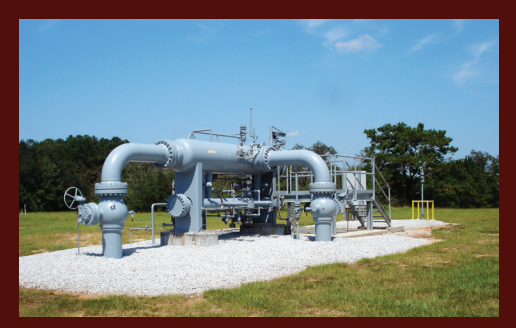
Natural gas pipeline terminal in Mobile, Alabama.