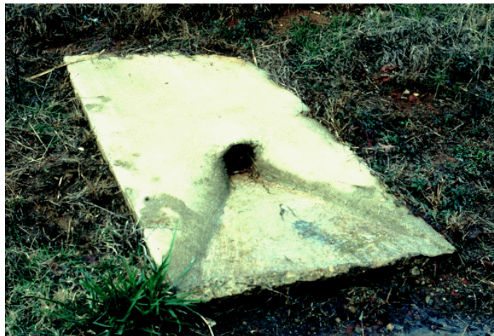
Photo No. 8 Large Outlet Pipe Headwall