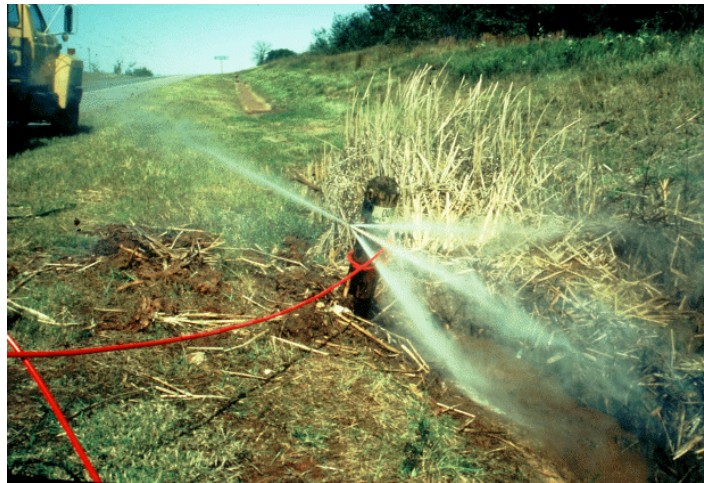
Photo No. 11 Pipe Flushing Unit

A pipe flushing unit is shown in Photo No. 11. The water jets point towards the rear of the unit so that the jetting action helps to propel the unit through the pipe.