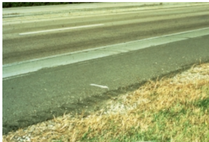
Photo No. 6 Painted Arrow as a Reference Marker

It is obvious that if maintenance personnel can not find the outlets, no maintenance can be performed. SHA's that use concrete headwalls, reference markers, signs on fences, reflector disks in the shoulder, or painted arrows on the shoulders have better success in providing maintenance. It is also important that maintenance activities not block or damage the pipe outlet. A simple arrow painted on the edge of the shoulder, as shown in Photo No. 6, is a good reference marker for maintenance personnel.