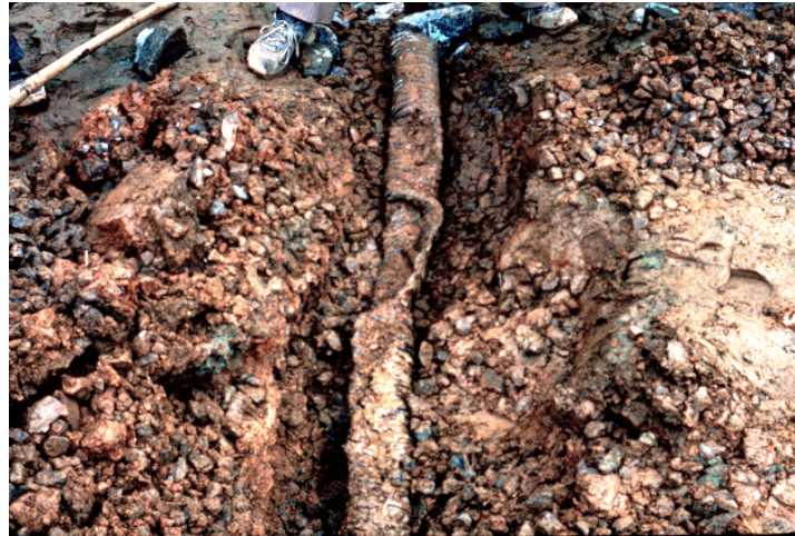
Photo No. 9 Crushed Edgedrain Pipe

Photo No. 9 shows a section of edgedrain that has collapsed. This problem was identified by video inspection.