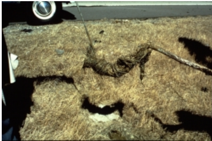
Photo No. 1 Vegetative Material Removed from an Edgedrain System

An example of vegetative material removed from an edgedrain is shown in Photo No. 1, while an edgedrain pipe blocked by a rodent's nest is shown in Photo No. 2.