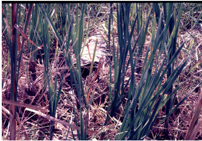
Photo No. 5 Hidden Outlet Pipe

Often outlets cannot be found because they are hidden by vegetative growth. Photo No. 5 shows a typical hidden and crushed outlet. Note that there is no headwall.