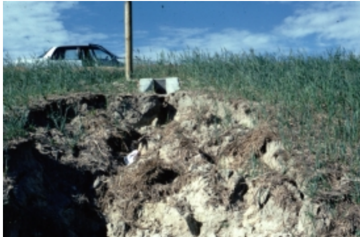
Photo No. 7 Excessive Erosion at the Outlet Pipe

One of the purposes of a headwall is to eliminate erosion at the pipe outlet. Unfortunately, excessive erosion at an edgedrain outlet is shown below in Photo No. 7.