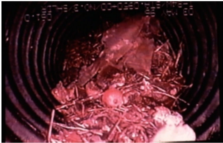
Photo No. 2 Rodent's Nest

Crushed pipe are shown in Photo No. 3 and 4. Most likely these pipe were crushed during construction.