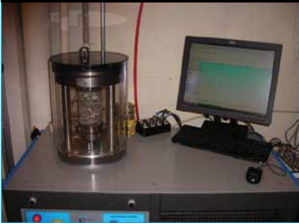
Figure 1. Dynamic Modulus Test Setup in the Asphalt Mixture Performance Tester.

pavement structures. However, the LTPP database contains data that could be used to estimate the |E^*| master curve and associated shift factors, which estimate |E^*| at specific load durations and temperatures, and thereby develop inputs to the models contained in the MEPDG.