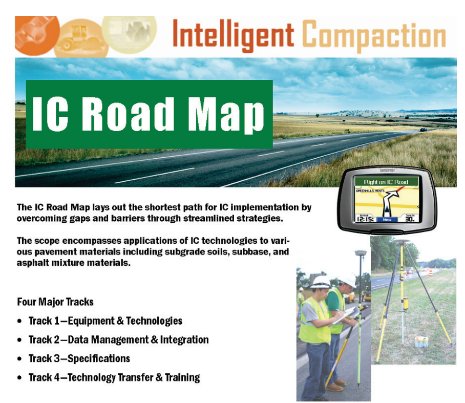
Figure 1. The Intelligent Compaction Road Map (Transtec Group)

The FHWA/TPF project, led by the Transtec Group, also developed an IC Road Map that addresses the gaps and barriers for implementation that includes four major tracks: (1) Equipment and Technologies, (2) Data Management and Integration, (3) Specifications, and (4) Technology Transfer and Training (see Figure 1). An extensive knowledge base was built from those field demonstrations and is readily available to the public via the IC website (<a href="www.intelligentcompaction.com">www.intelligentcompaction.com</a>), also developed and maintained by the Transtec Group. The IC National Workshops under the FHWA TOPR No. 5 (DTFH61-10-D-00027) are intended to address key elements of the IC Road Map.