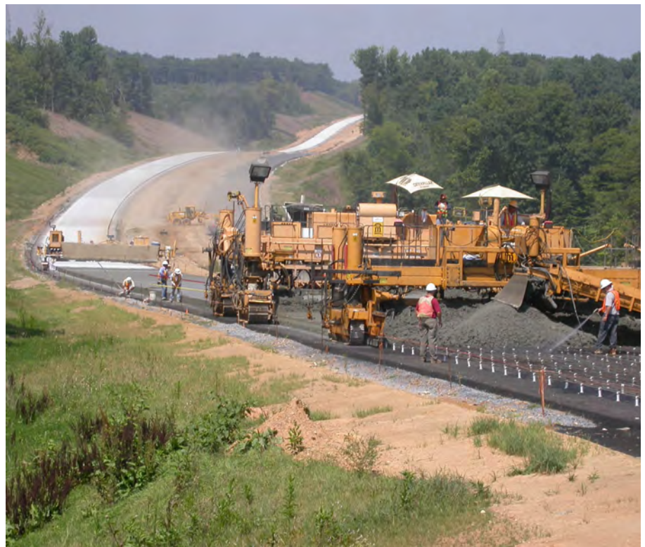
FIGURE 1. A continuously reinforced concrete pavement under construction.

Continuously reinforced concrete pavement (CRCP) is enjoying a renaissance across the United States and around the world. CRCP has the potential to provide a long-term, “zero-maintenance,” service life under heavy traffic loadings and challenging environmental conditions, provided proper design and quality construction practices are utilized. (An example of CRCP construction is shown in figure 1.) This TechBrief provides an overview of the CRCP technology and the major developments that have led to what are referred to herein as