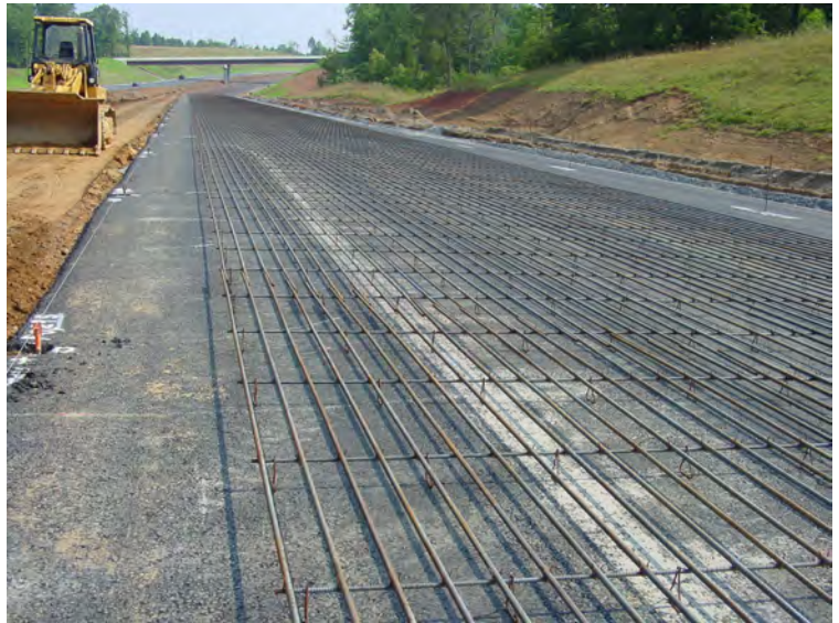
FIGURE 2. View of concrete reinforcement using Grade 60 bars.

CRCP is a unique rigid pavement in that it has no constructed transverse contraction or expansion joints except at bridges or at pavement ends. The use of longitudinal steel reinforcement, typically Grade 60 bars (see figure 2), results in a series of closely spaced transverse cracks. The steel reinforcement is used to control the crack spacing and the amount of opening at the cracks and to maintain high levels of load transfer across them. Modern CRCP is built with longitudinal reinforcing steel percentages in the range of 0.65 to 0.80 percent (lower in milder climates, higher in harsher). Equally important as the percentage of steel content is the bond area between the concrete and the bars, which the Federal Highway Administration (FHWA) recommends at a minimum of 0.030 square inch per cubic inch of concrete (FHWA 1990).