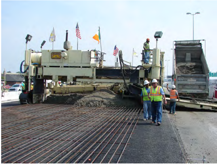
FIGURE 4. Side placement of concrete.

of the base and steel bars just in front of the paver, and whitewashing the asphalt base prior to placement of the reinforcement (as long as it does not reduce bonding and friction with the CRCP, as this will greatly affect crack spacing and width). The use of HIPERPAV® software at the construction site can provide relative information regarding expected CRCP cracking patterns if there are drastic temperature changes, and various remediation measures (changes in concrete mixture, curing techniques, etc.) can be implemented.