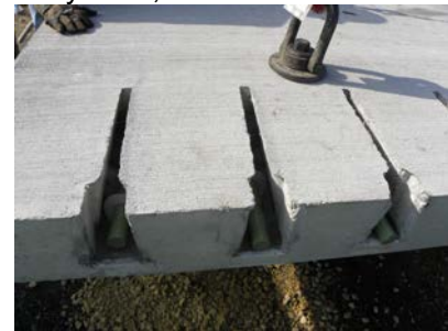
Figure 3. Photo. SHRP2-developed surface slot system, Illinois Tollway version 1.