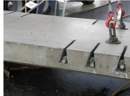
Figure 2. Photo. SHRP2-developed surface slot system, standard version.

Three versions of the narrow-mouth surface slot system were developed, as are shown in figures 2, 3, and 4.