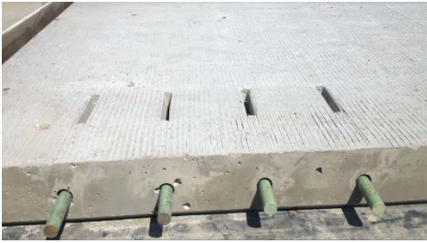
Figure 5. Photo. The Barra Glide dowel system, showing the partially open narrow slots at the surface of the precast panel.

slots are then patched using the dowel bar retrofitting technique. The dowel bar holes are grouted using a fast-setting, high-strength cementitious grout.