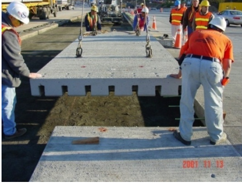
Figure 1. Photo. Super-Slab® with dowel bar slots at the bottom of the panel.