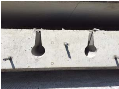
Figure 6. Photo. Caltrans teardrop-shaped surface slot.