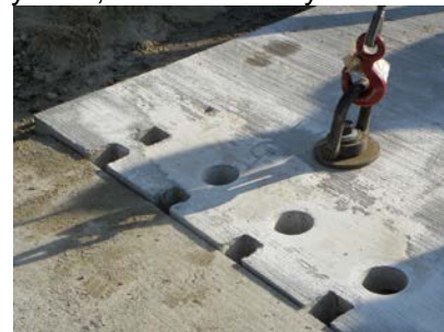
Figure 4. Photo. SHRP2-developed surface slot system, Illinois Tollway version 2.

Illinois Tollway's versions incorporate a widened slot at the joint face, as shown in Figures 3 and 4. The widening was provided to allow hand access within the slot for easier pushing of the dowel bars into the drilled holes and to allow for the twisting motion of the dowel bar for better epoxy distribution around the dowel bars. The tollway has adopted Version 1 for intermittent repair applications.