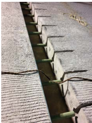
Figure 7. Photo. Embedded dowel bars being slid into the teardrop-shaped slots.