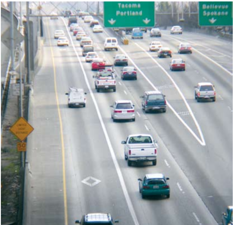
A typical travel day in Seattle.