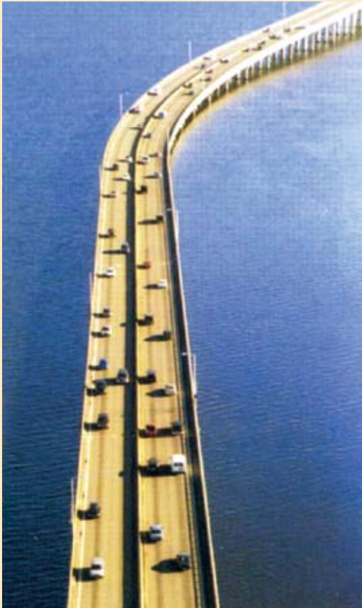
WSDOT's SR-520 Floating Bridge in Seattle.

For each case study, FHWA representatives interview State transportation staff and compile the information, and the State approves the resulting material. Thus, the case study reports rely on the agencies' own assessment of their experience. Readers should note that the reported results may not be reproducible in other organizations. ■