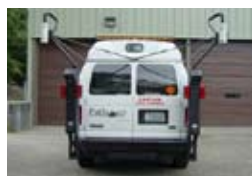
Rear view of pavement survey vehicle.

of high-resolution digital imaging to determine the amount of cracking and patching, pavement roughness and rutting annually on all state highways. Cameras view the driver perspective, the right shoulder, and the pavement surface. The digital images are played back on special workstations at slow speeds and surface distresses are identified and rated by trained technicians. Quality control checks are applied throughout the rating process to verify and validate the accuracy of the distress data.