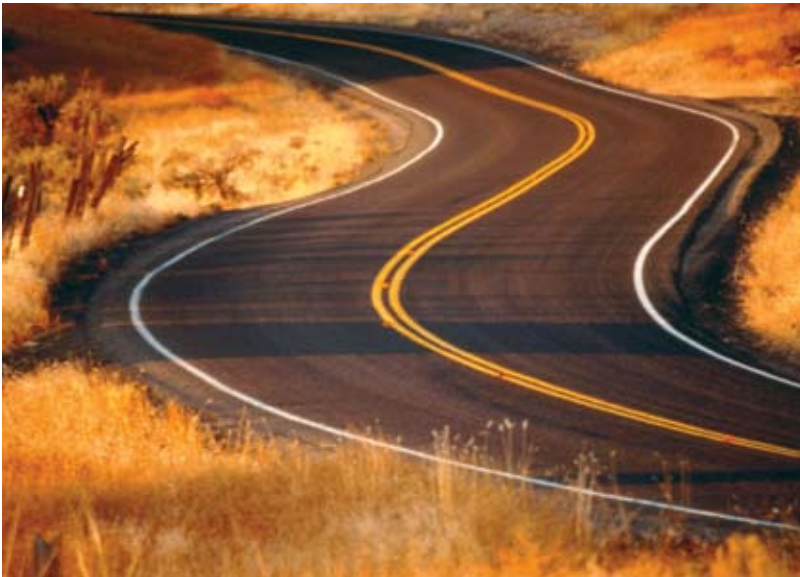
A roadway in eastern Washington State.

“In light of ever-changing conditions, we are focused on meeting those performance goals we hold near and dear,” says Yates. “Our goal is to keep moving forward.”