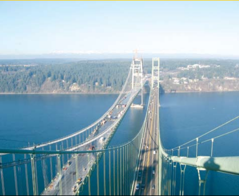
The existing (right) Tacoma Narrows Bridge and the new bridge span under construction.

A comprehensive, fully integrated Transportation Asset Management System weaves together information on all asset inventories, condition and performance databases, and alternative investment options.