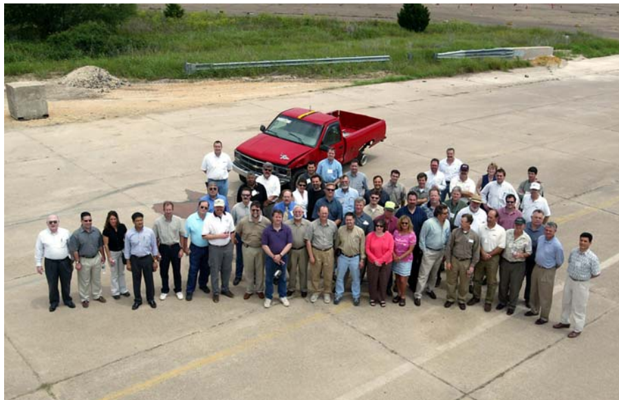
Task Force at Texas Transportation Institute College Station - Spring 2003