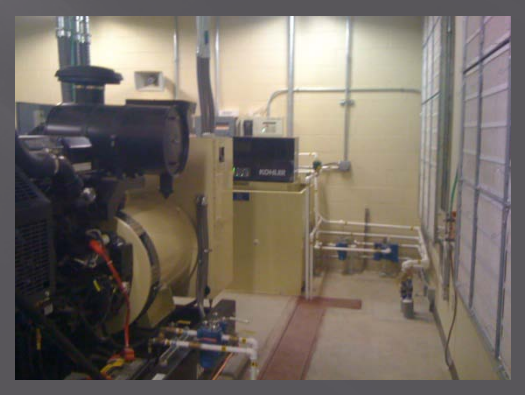
New Tower / Back-up Generator