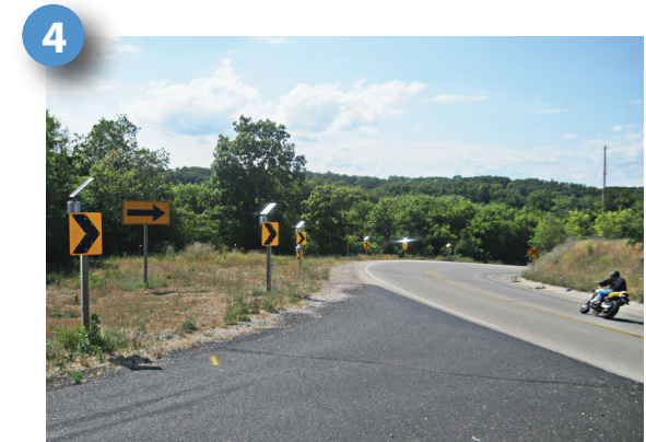
4 Wisconsin State Highway 20

Sign up to receive an e-mail notification on this project at: