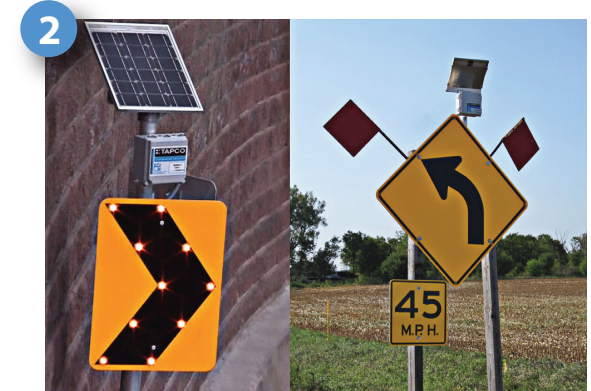
2 Approaching vehicles, sensed by a radar in the advanced curve warning sign, trigger the controller that wirelessly activates the LED signs to flash sequentially through the curves to warn speeding drivers to slow down.