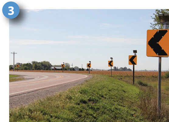
3 Iowa State Highway 144