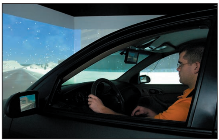
University of Tennessee

Did you know that 76% of people with mild dementia could pass a driving test? How can experts determine who among people with cognitive impairments is still a safe driver and who is not? How can they test this without posing risks to other drivers? What elements make up an accurate diagnostic model? What social issues must be considered in this model? A collaborative effort to answer these questions is underway by a University of Tennessee research team from the College of Engineering, the Department of Psychology, and the Cole Neuroscience Center (CNC) in the Graduate School of Medicine.