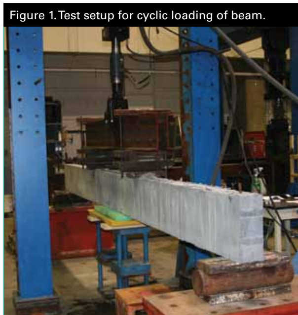
Figure 1. Test setup for cyclic loading of beam.

One mild steel reinforced, rectangular cross section UHPC beam spanning 16 ft (4.88 m) was fabricated. This beam was subjected to cyclic structural loading in a four-point bending configuration. Figure 1 shows the loading arrangement. The magnitude of load surpassed the elastic limit of the UHPC cementitious matrix, thus causing a series of flexural cracks to occur near midspan.