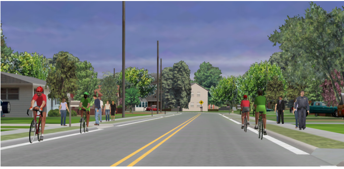
Pedestrian and bicyclist images rendered through the NADS-1 graphics system.

traffic safety data from the National Highway Traffic Safety Administration. Recent advances in connected vehicles technology allows cars to “communicate” with each other by sending “Here I am” messages. This project will examine the effectiveness of vehicle to pedestrian (V2P) warnings by developing a pedestrian warning system delivered via a mobile device equipped to receive “Here I am” messages from approaching vehicles in the pedestrian simulator.