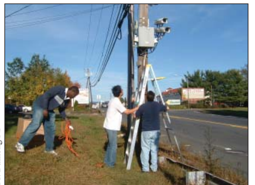
RTIC staff students in the field.

Although the overarching aim of the UMTC RTIC project is to assist regional stakeholders in establishing an effective traveler information system to serve MassHighway's Statewide 511 system,