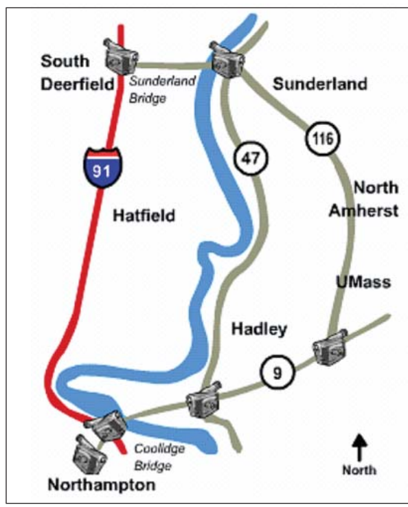
Location of web cameras.

The initial focus in the RTIC project was to provide travel times and congestion information in the Coolidge Bridge area along State Route 9, serving a major commuter corridor and ambulance route in Western Massachusetts. Travel time estimates were derived initially using automated video license plate recognition technologies. Currently, travel time estimates are obtained for a five-mile section