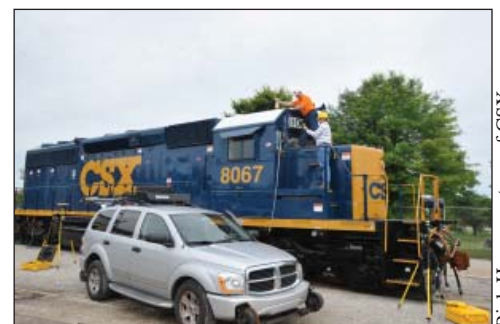
Rick Hays courtesy of CSX

One reason mainline tracks must be surveyed is so that precise (computer based) maps can be produced that will facilitate the implementation of freight and passenger rail safety technologies as well as operational enhancement