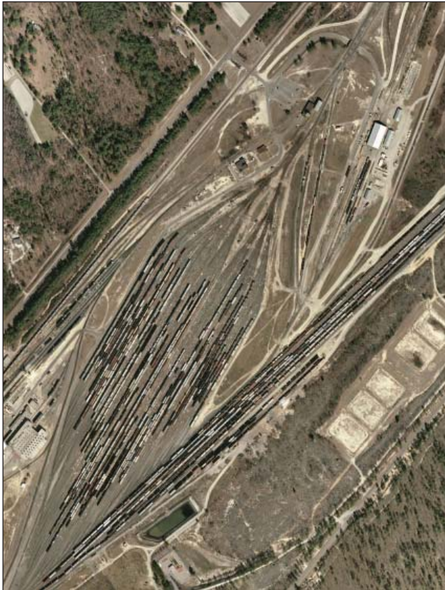
This photo shows a recently surveyed rail yard. The length is nearly one mile with over 50 separate parallel tracks. The photo also shows the typical number of railcars present in an operating rail yard.

surveys can be used to monitor track changes over time. Such checks would be helpful in areas where track safety is impacted from heavy use, extreme temperature fluctuations, or precipitation. Data accuracy is precise enough to help identify, characterize, and target maintenance requirements, especially when this information is available to track inspectors as they conduct visual track safety inspections. 🌐