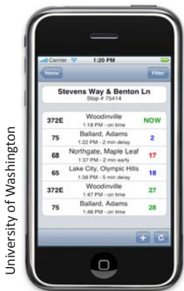
University of Washington

Improving the experience of the rider is key to convincing customers to trade the comfort and convenience of their own vehicles for the economic and environmental advantages of public transit. At the University of Washington, students have come a long way toward attaining this goal by developing OneBusAway—a real-time transit information system available for free in a variety of formats: web, phone, SMS texting, Android, and iPhone. OneBusAway provides real-time transit information for Metro Transit, Pierce Transit, Sound Transit, and Washington State Ferries ( www.onebusaway.org ).