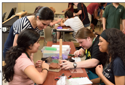
Michigan State University