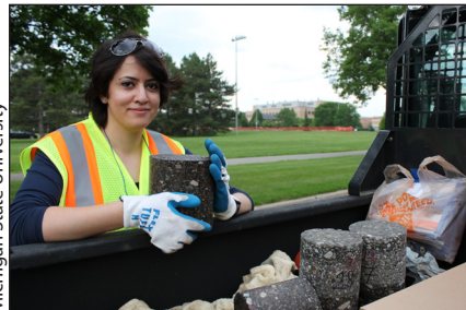
Michigan State University