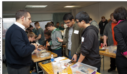
Michigan State University

The National Center for Pavement Preservation was established in 2003 by Michigan State University (MSU) and the Foundation for Pavement Preservation as the national pavement preservation clearinghouse for practitioners throughout the United States.