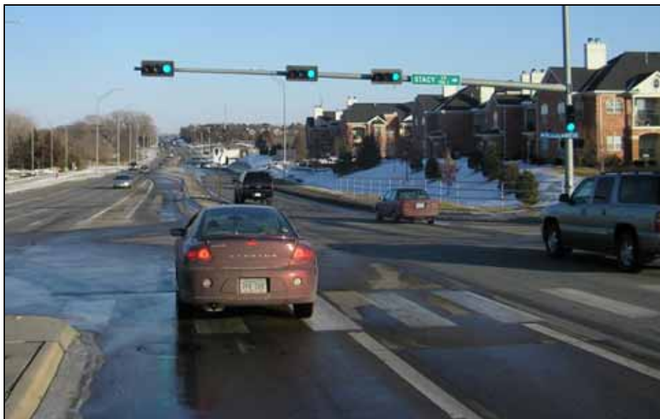
Figure 3. Photo. Example of a type 2 installation in Lincoln, NE (lateral separation with no offset).