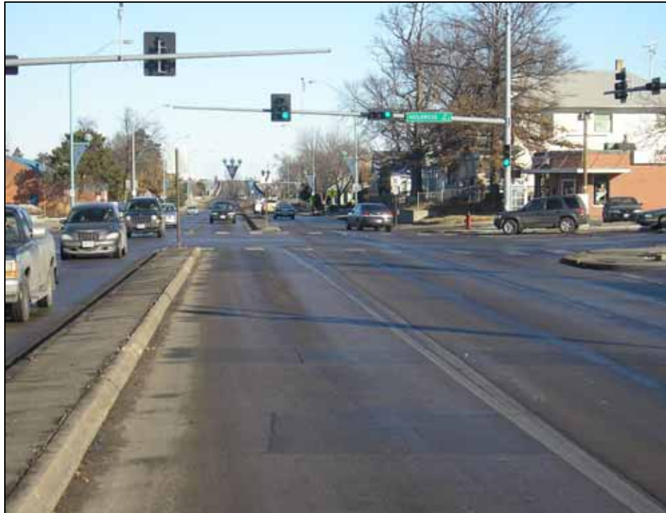
Figure 4. Photo. Example of a type 3 installation in Lincoln, NE (lateral separation with negative offset).