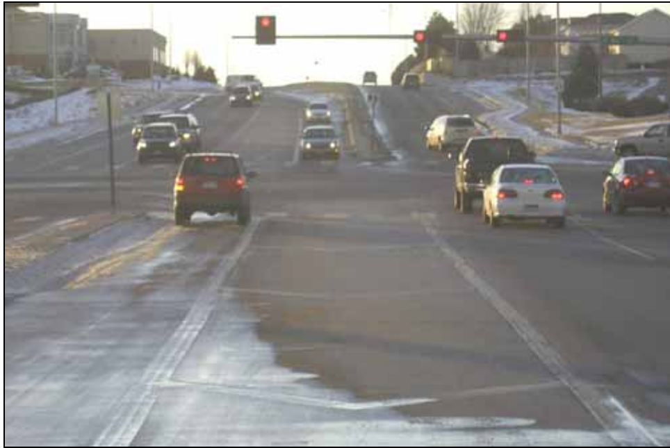
Figure 2. Photo. Example of a type 1 installation in Lincoln, NE (positive offset).