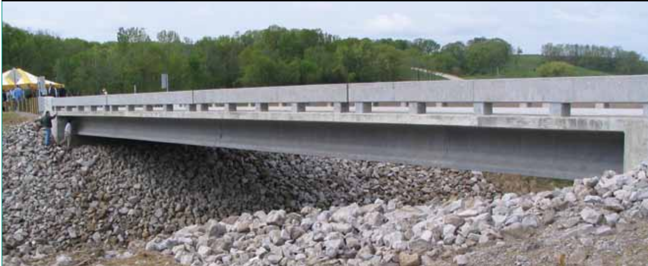
Figure 1. This Wapello County, Iowa, structure was the first UHPC bridge constructed in the United States.

concrete elements were constructed in New York. In one case, the UHPC was used in transverse connections between precast deck panels. In the other case, the UHPC was used in longitudinal connections between the top flanges of deck-bulb-tee girders (see figure 2). Field-cast UHPC will also be used in the longitudinal and transverse deck-level connections of the UHPC waffle slab bridge.