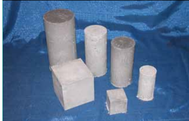
Figure 4. Either cylinders or cubes can be used for compression testing of UHPC.

(1 MPa/s) has been demonstrated to be acceptable, thus allowing for individual tests to be completed in a reasonable timeframe. (15)