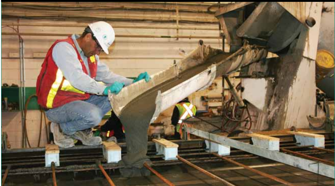
Figure 3. UHPC is delivered via truck chute to a precast girder form. UHPC can be used in both precast and field-cast applications.

Immediately after casting, any exposed UHPC surface needs to be sealed with an impermeable layer. Metal, plastic, or plastic-coated wood are appropriate materials with which to seal the surface. The seal must rest against the UHPC and should not allow for any space between the covering material and the fresh concrete. Sealing of the surface eliminates the possibility of surface dehydration, which can lead to cracking and significant degradation of final material properties.