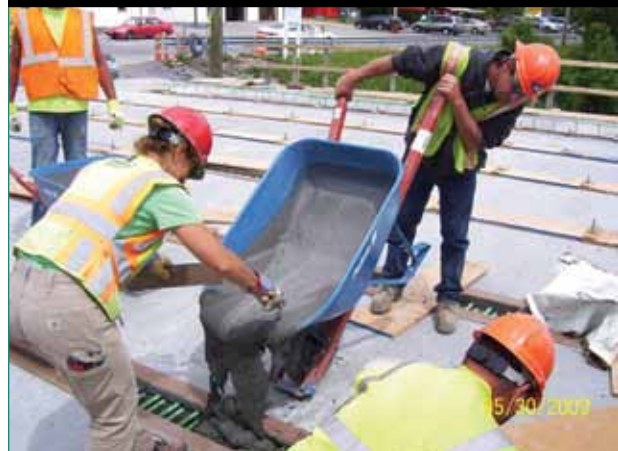
Figure 2. Longitudinal connections are cast between deck-bulb-tee girders on the Route 31 Bridge in Lyons, NY. Field-cast UHPC can simplify connection details and ease constructability.