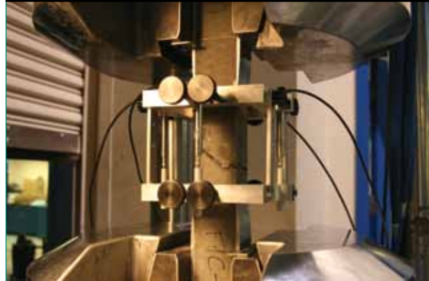
Figure 5. Testing procedures aimed at directly capturing the tensile behavior of UHPC are under development.

surface penetration of the water, localized hydration, and increased dynamic modulus. In practice, freeze-thaw testing can indicate that the UHPC performance is bolstered through exposure to these conditions, while in actuality the thaw portion of the cycle is facilitating delayed hydration and a requisite dynamic modulus increase.