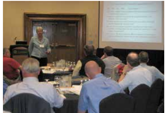
The Construction Peer Network held its final regional peer exchange July 9–10, 2013, in Boise, ID.