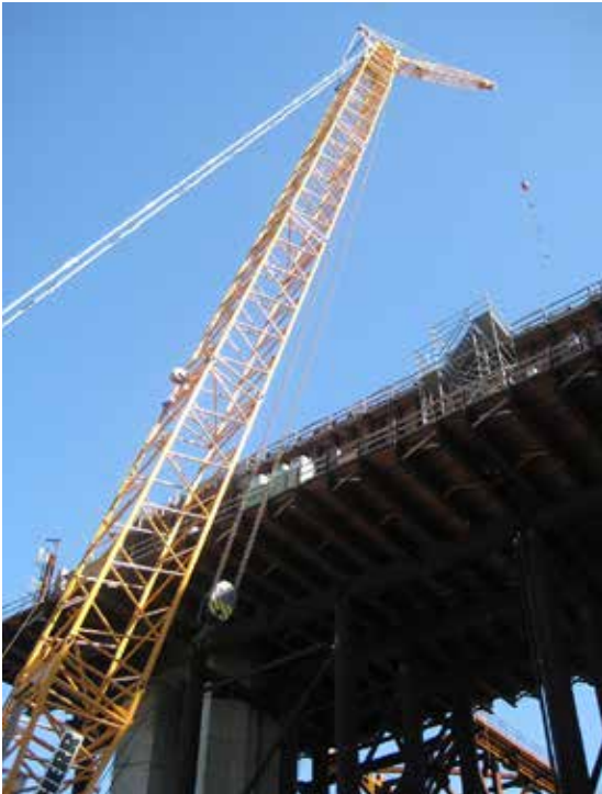
Five regional peer exchanges sponsored by the Construction Peer Network helped to identify best highway construction practices nationwide.