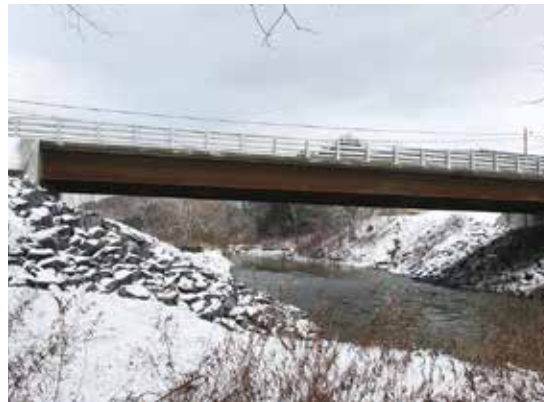
Field-cast UHPC connections were used to construct the Route 23 bridge in Oneonta, NY.