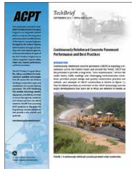
More information about CRCP design is available in FHWA’s Tech Brief on Continuously Reinforced Concrete Pavement Performance and Best Practices .

CRCP use began in Texas in 1951 and continues to increase as the Texas Department of Transportation expands its roadway