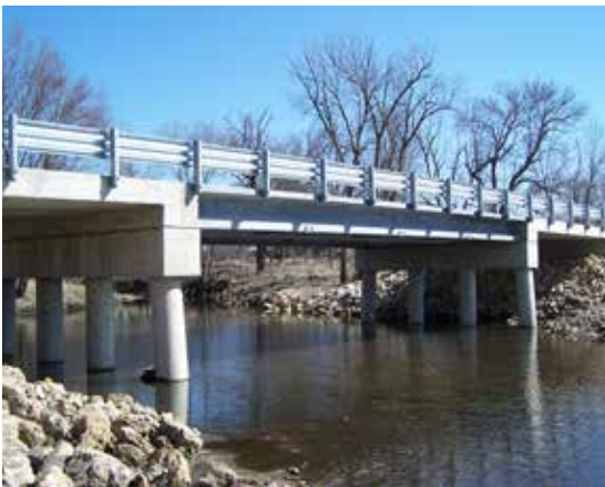
The Jakway Park bridge in Buchanan County, IA, features UHPC girders.

Bridges built in Iowa, Montana, New York, and Oregon, meanwhile, have used field-cast UHPC connections between prefabricated bridge components. The bridges, including the Route 31 bridge over the Canandaigua Outlet in Lyons, New York, and the U.S. Route 6 bridge over Keg Creek in Pottawattamie County, Iowa, use a range of details to connect different precast concrete modular bridge components, including adjacent