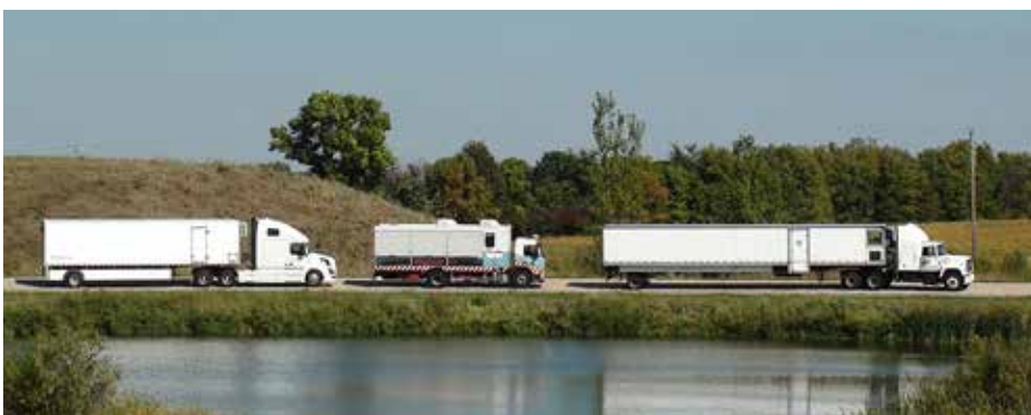
FHWA tested moving pavement deflection devices at Minnesota's MnROAD pavement testing facility in September 2013.

In Virginia, pavement management is being improved through a new structural index that can be used to include data on the pavement's structural condition as part of a network-level pavement evaluation. Developed by researchers at the Virginia