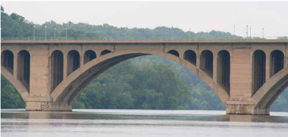
The FHWA study developed an approach for categorizing bridges and pavements in good, fair, or poor condition that could be used consistently across the country.

formance measures that can be used to categorize bridges and pavements were then evaluated. These tiers were previously defined by AASHTO. Tier 1 measures are considered ready for use at the national level, while Tier 2 measures require further work before being ready for deployment. Tier 3 measures are generally still in the proposal stage.