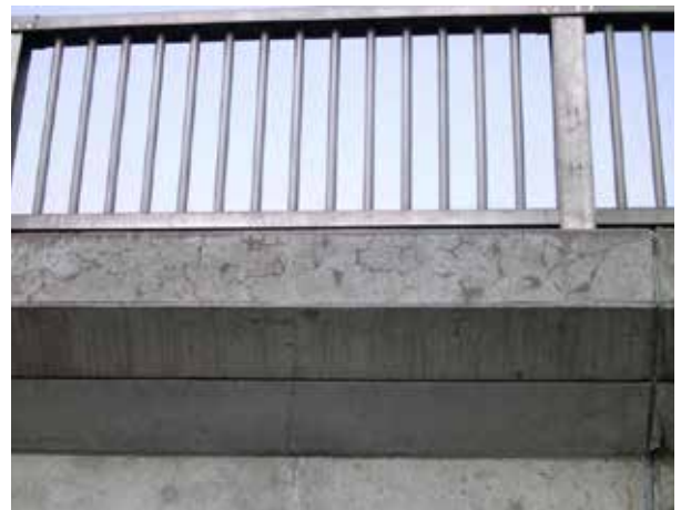
Top: This concrete highway barrier is affected by ASR.