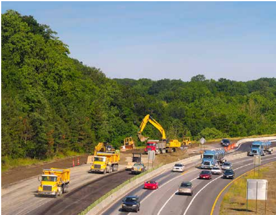
A new FHWA project is developing procedures to guide the timing and selection of pavement preservation and rehabilitation practices.

Tech Transportation Institute's Center for Sustainable Transportation Infrastructure, under contract to the Virginia Center for Transportation Innovation and Research (VCTIR), the Modified Structural Index (MSI) for asphalt pavements minimizes discrepancies between network-level predictions and project-level decisions. A modified version of the Texas Department of Transportation Structural Capacity Index, the MSI was developed for use by the Virginia Department of Transportation (VDOT).