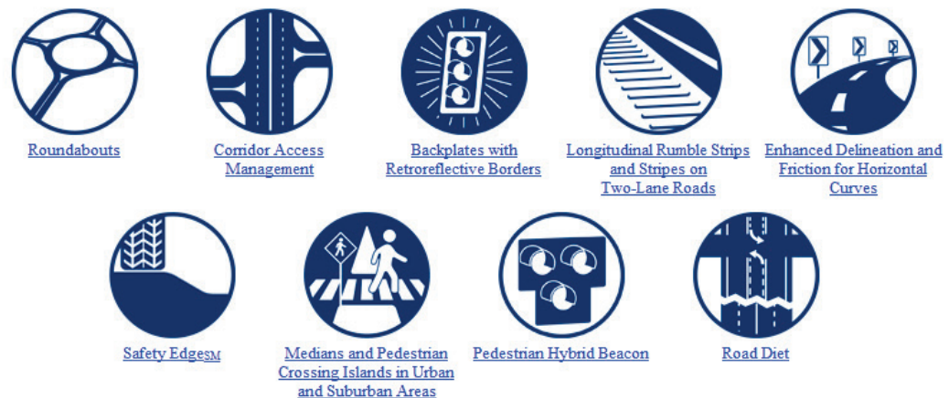
Figure 2.2 Screenshot of Proven Safety Countermeasures

The Office of Safety defines nine Proven Safety Countermeasures, shown in Figure 2.2. They encourage their partners to "continue to strengthen their evidence-based decisionmaking processes, as highlighted in the Highway Safety Manual, and systemic planning approaches to make improved safety investment decisions." The Office of Safety takes on the role of "continu[ing] to provide guidance and technical assistance to encourage these practices. We will also continue to research, identify and advance proven safety countermeasures and to provide those countermeasures to you and our partners so they can be integrated into this approach and used to help save lives and prevent serious injuries." 1