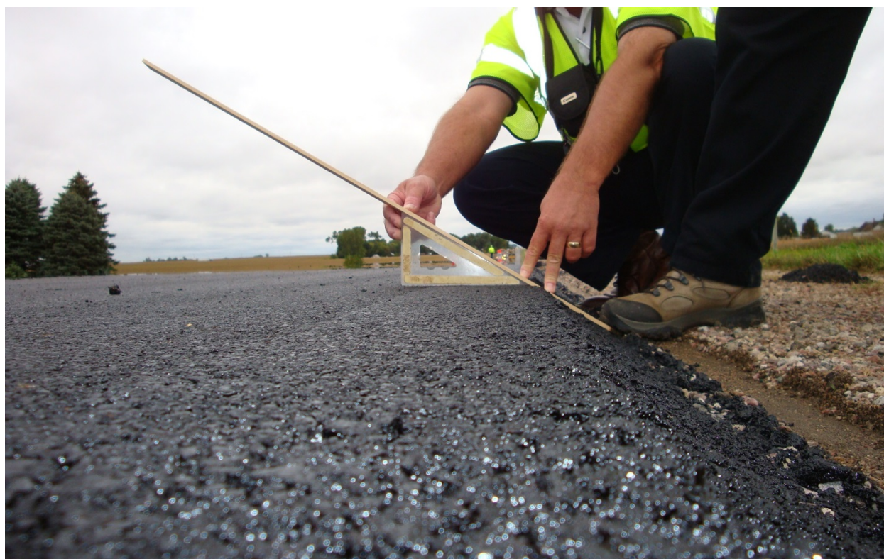
Figure 12. Sloping the edge of the pavement allows drivers who drift off the edge to correct and return to the roadway.

Roadway departures account for over half of all fatal crashes in the U.S. and pavement edge drop-off on roadways has been linked as a contributing cause of many such crashes. To mitigate vertical drop-offs, installing the Safety Edge SM on pavements is another safety initiative advocated through EDC. This low-cost technology allows drivers who drift off highways to return to the pavement safely. By simply shaping the edge of the pavement to 30 degrees, the safety problem of vertical drop-off can be mitigated. The Safety Edge SM provides a durable transition on which vehicles can return to the paved road smoothly and easily, even at relatively high speeds.