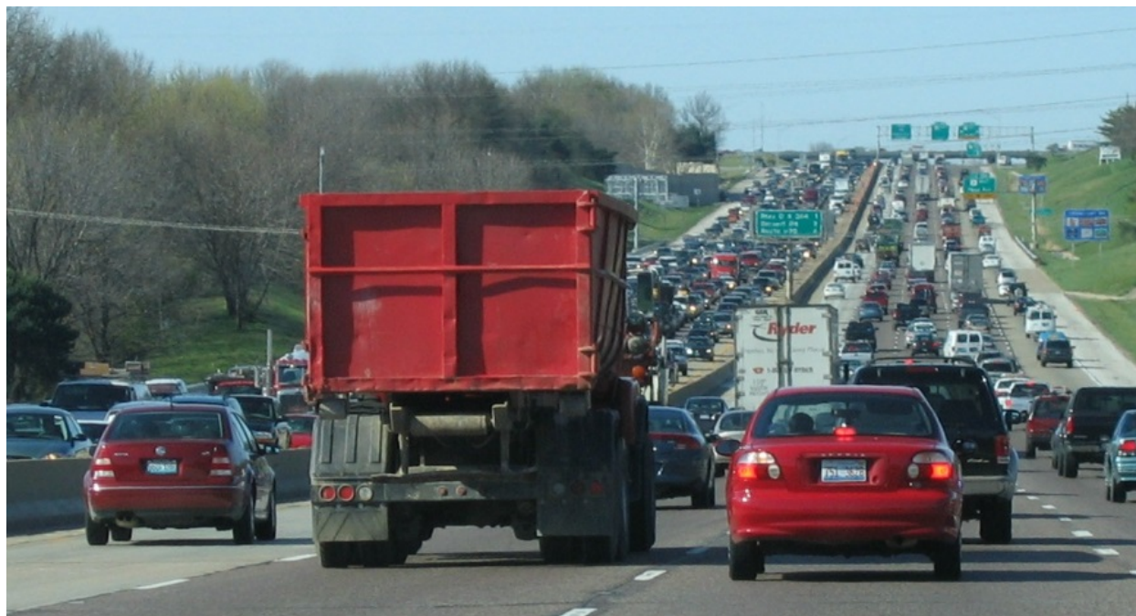
Figure 1. Congestion typical of many U.S. urban areas