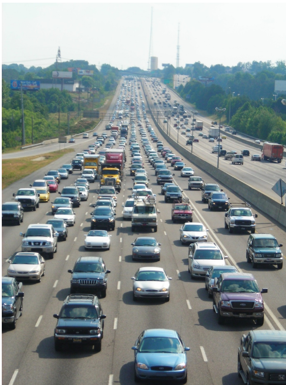
Figure 6. High-occupancy toll lanes in use on I-85 in Georgia