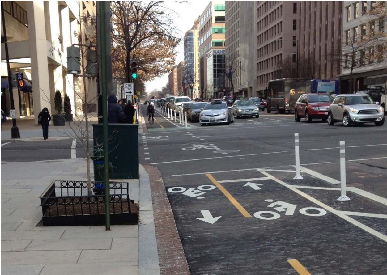
Figure 4. Separated bike lanes on 15 th Street in Washington, D.C.