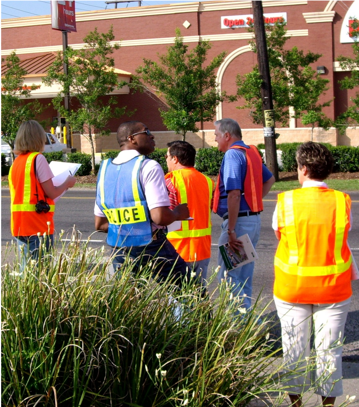
Figure 3. A multidisciplinary road safety audit team observes conditions in the field.