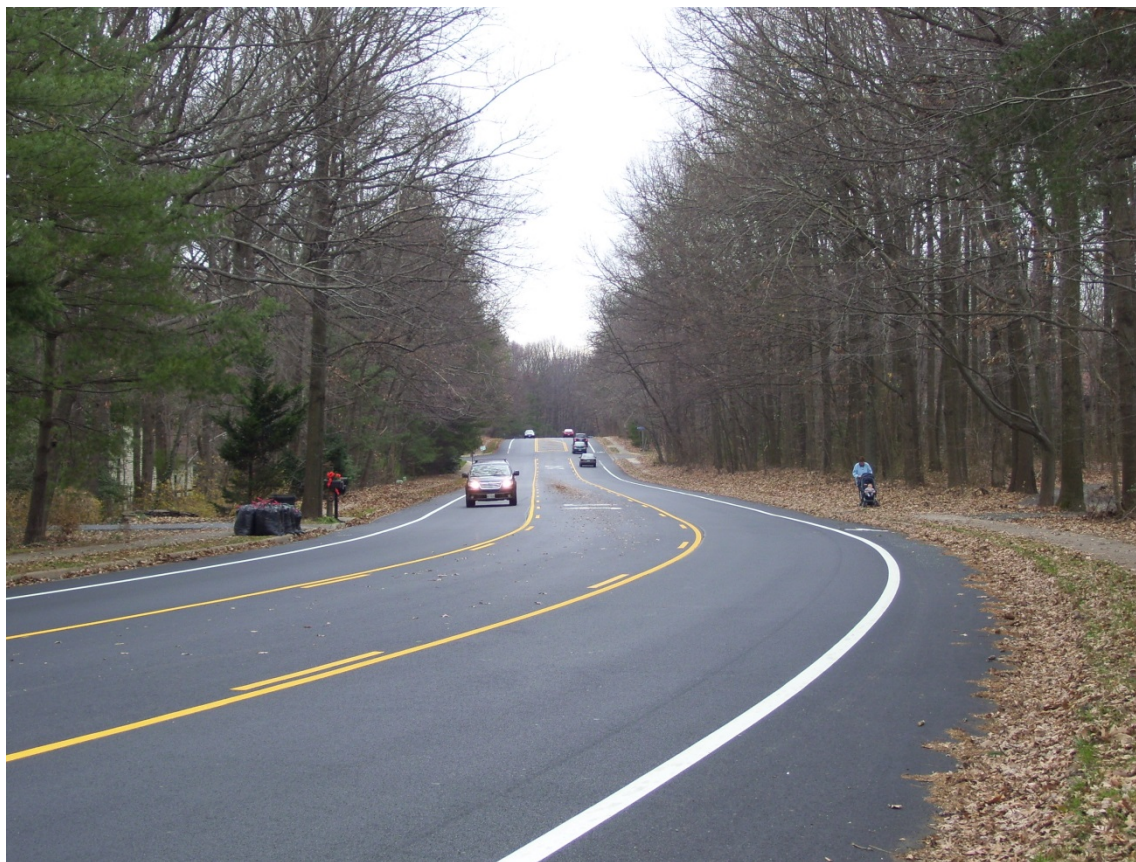
Figure 10. Final configuration after a Road Diet, with one lane in each direction, a two-way-left-turn-lane, and bike lanes.