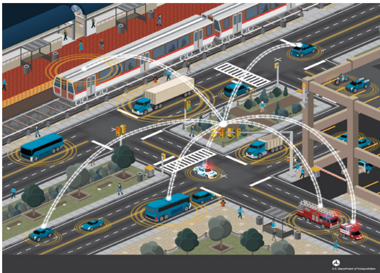
Figure 15. Connected vehicles of all types communicating at a busy intersection.