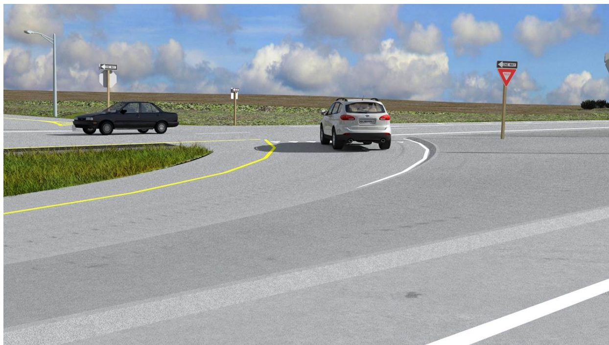
Figure 14. Using visualization, the design can be evaluated from the driver's perspective. Image developed by: Brandon Filides, Iowa DOT

The push toward electronic deliverables has necessitated a more complete and more consistent 3D model on each project. This has provided benefits in resolving more traditional design issues. In the past, visualization efforts focused on preparing photo-realistic images required special processing that was reserved for high profile projects. With the 3D model becoming the primary focus of designers, high quality, complete models are available for most projects. Aerial images can be draped over the existing terrain model with the 3D design superimposed over the existing terrain to provide a quick, good quality 3D visualization for public meetings or to address issues with multidisciplinary review teams. This allows the designer to move within the model to discuss any location with a property owner rather than just the locations that were fully developed with photo-realistic drive-throughs.