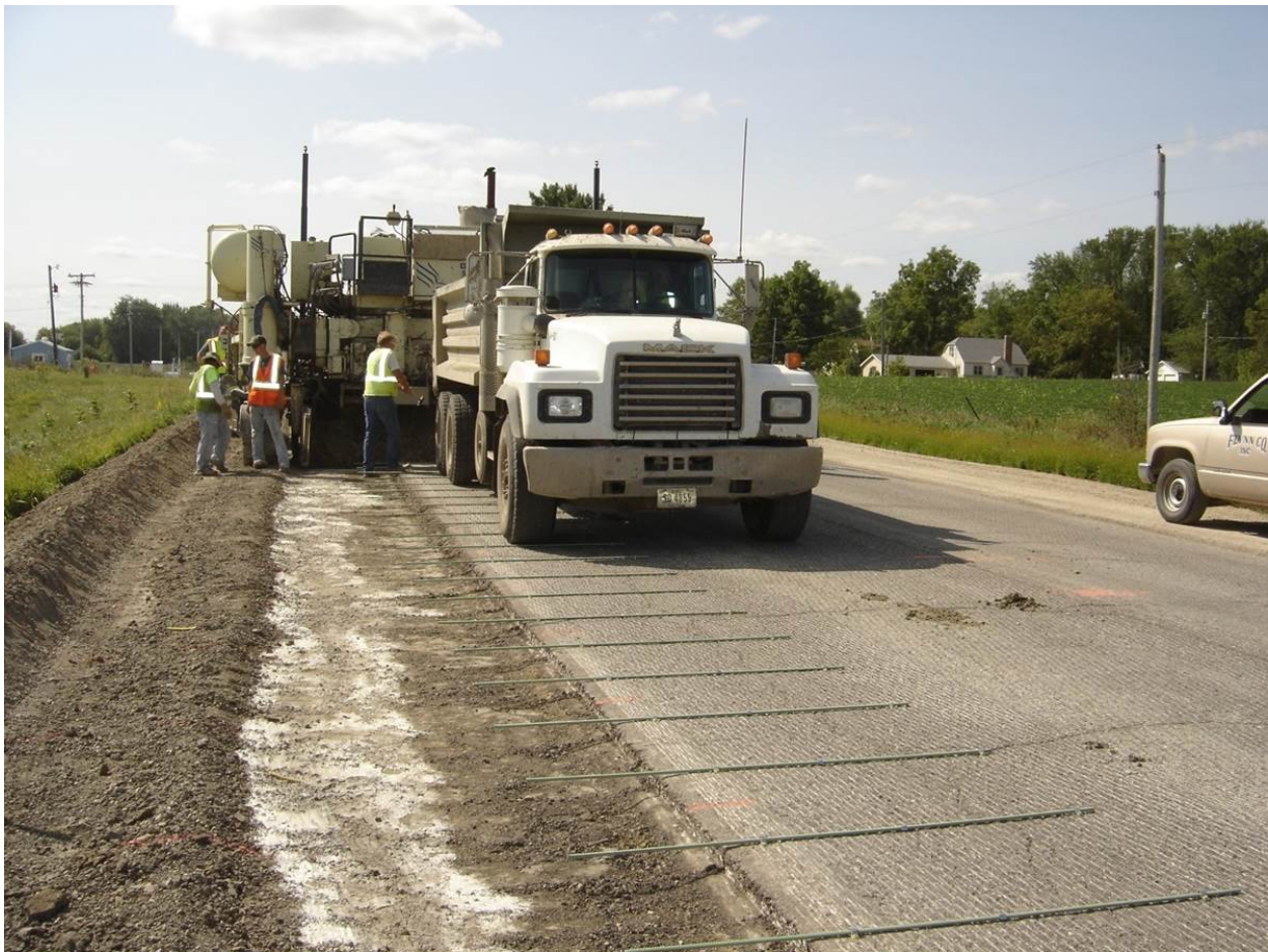
Figure 13. Concrete paver uses automated machine guidance with no need for string-lines.

Construction firms, both large and small, have been investing in Automated Machine Guidance technologies for their equipment, as shown in Figure 13. The equipment has advanced to the point that even precision work, such as paving, can be completed without traditional survey and staking. To take full advantage of their investment, the contracting industry has been working with DOTs to expedite the transition to electronic files. States are now using the traditional design software to export 3D terrain files that can be transferred directly to the contractors' equipment. This reduces the chance of survey errors and typos that can occur as data is copied into or out of the paper plans. As the contract documents move away from traditional paper formats and toward a transfer of data, States have placed increased emphasis on accuracy of the models, consistency of data formats, ensuring data is not corrupted during usage, file security, digital signatures and related issues.