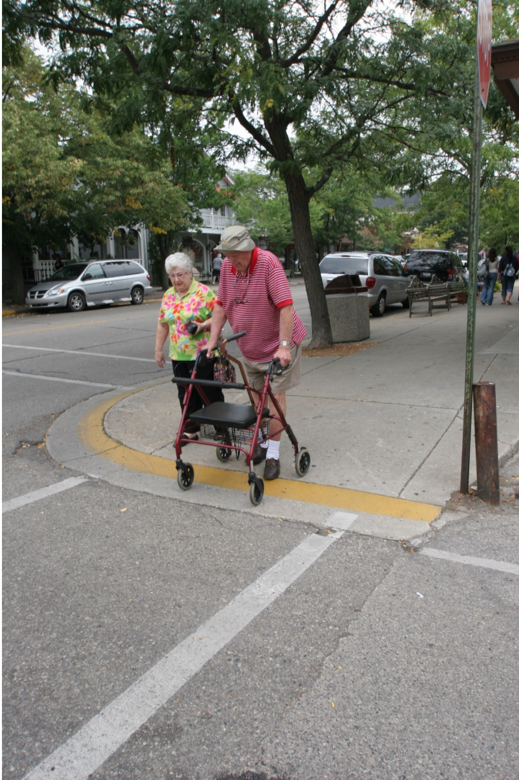
Figure 5. Pedestrian with physical impairment crossing street in Saugatuck, Michigan