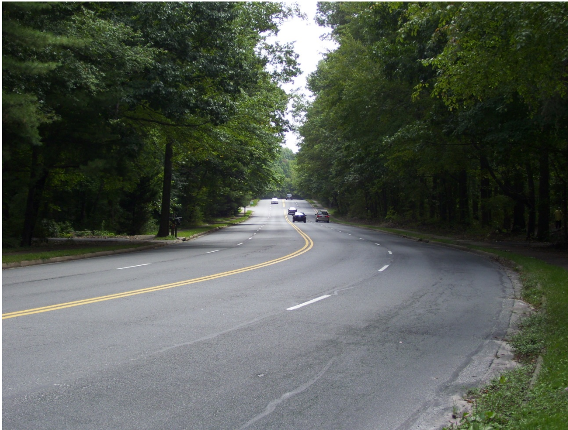
Figure 9. Original configuration before a Road Diet, with two lanes in each direction.

A roadway reconfiguration, also known as a road diet, is another safety innovation promoted through EDC. Road diets offer several high-value improvements at a low cost when applied to traditional four-lane undivided highways. Benefits of a road diet include enhanced safety, mobility and access for all road users and a "complete streets" environment to accommodate a variety of transportation modes. A classic road diet typically involves converting an existing four-lane, undivided roadway segment to a three-lane segment consisting of two through lanes and a center, two-way left-turn lane, as shown in Figures 9 and 10. The benefits include crash reductions, reduced vehicle speed differential, improved mobility and access by all road users, and integration of the roadway into surrounding uses that result in an enhanced quality of life. A key feature of a road diet is that it allows reclaimed space to be allocated for other uses, such as turn lanes, bus lanes, pedestrian refuge islands, bike lanes, sidewalks, bus shelters, parking or landscaping.