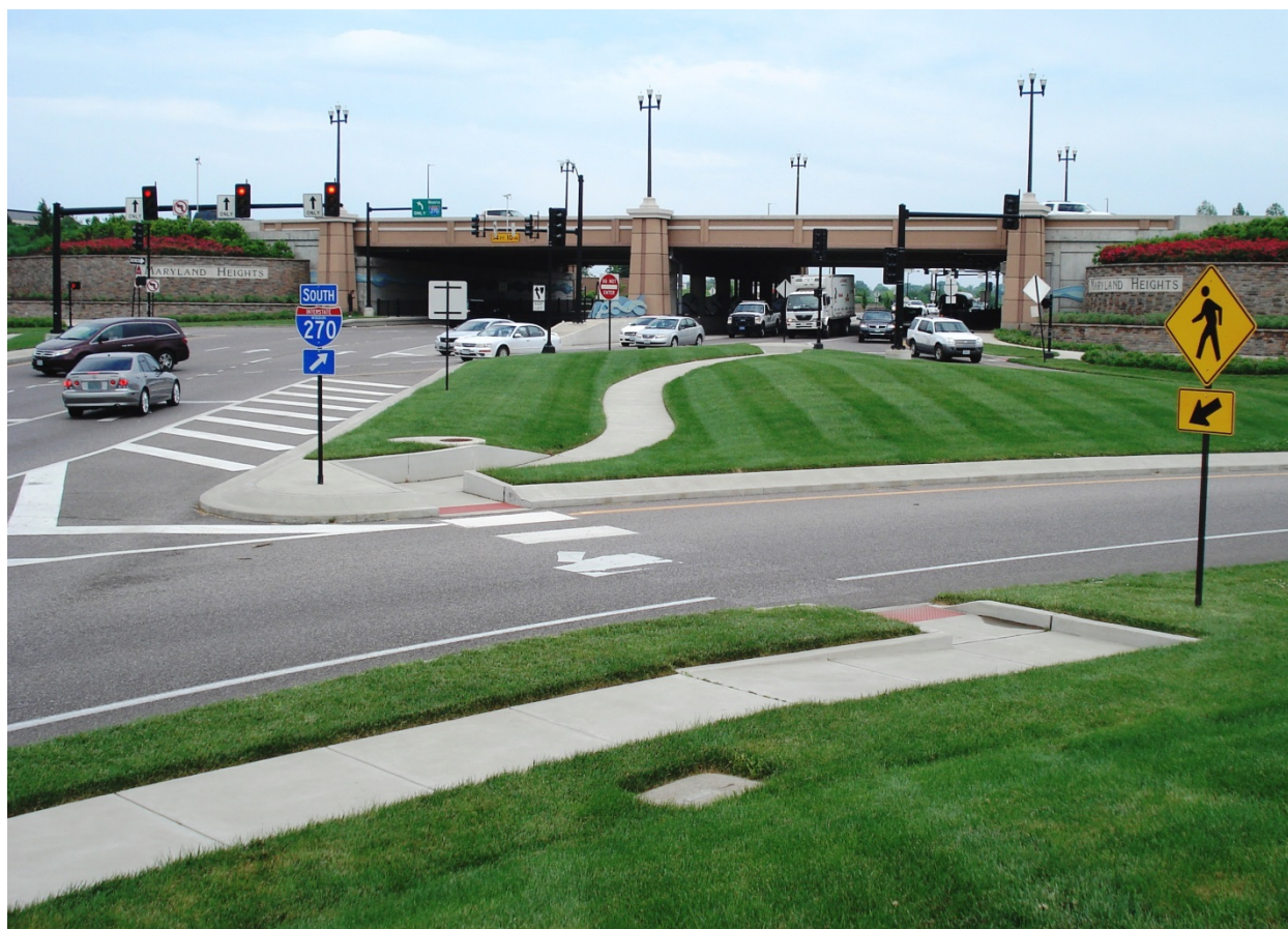
Figure 8. Diverging diamond interchange at I-270 and Dorsett Road in St. Louis, Missouri