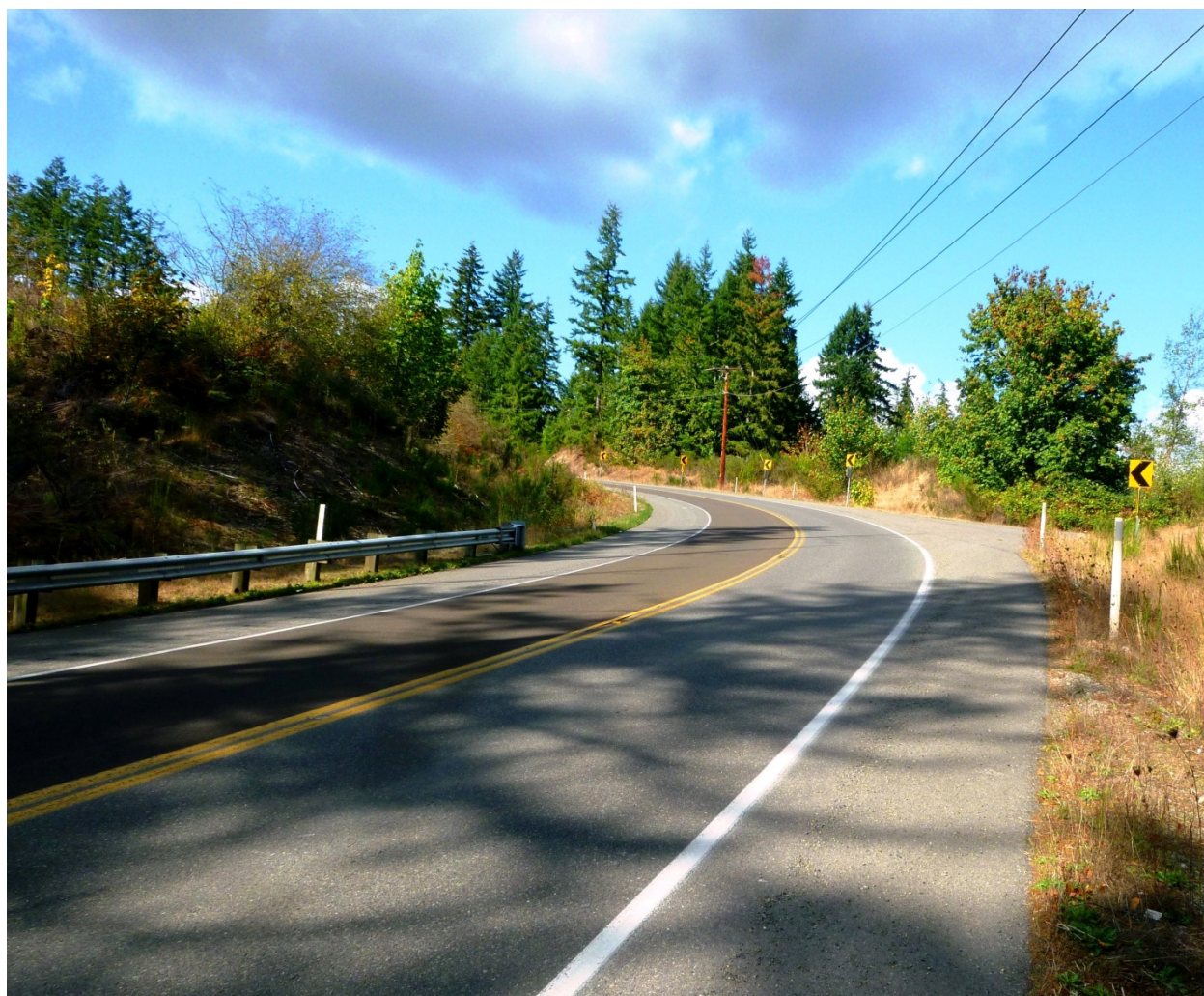
Figure 11. High-friction surface treatment has been applied on one lane of a curved roadway. Eventually, the other lane was treated as well.

Horizontal curves made up only 5 percent of the highway miles in the U.S., yet more than 25 percent of U.S. highway fatalities occur at or near horizontal curves each year. While some of the factors contributing to these crashes include excessive vehicle speed or distracted driving and driver error, at some locations, the deterioration of pavement surface friction may also be a contributing factor. Variable friction creates the need to consider pavement improvements for surface characteristics, particularly for friction, at certain locations in order to increase safety.