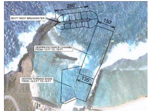
Figure 1. Breakwater design at Faleasao Harbor, American Samoa