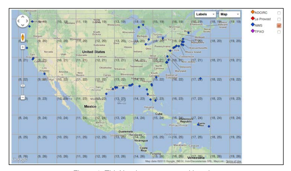
Figure 1. TideNet data sources and locations

The TideNet is a web-based Graphical User Interface (GUI) that provides users with GIS mapping tools to query tide data sources in a desired geographic region of USA and its territories (Figure 1). Users can select a tide data source through the Google Map<sup>®</sup> interface to view data and parameters of interest. TideNet allows users to fetch the data from a source to plot, analyze and extract tidal information in different formats based on a user-specified time window, and output tide data for engineering applications. TideNet has additional post-processing capabilities to produce tables and figures, and prepare input files for numerical models used in USACE projects.