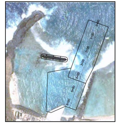
Figure 2. Channel deepening/ widening at Faleasao Harbor, American Samoa

The Corps Operation and Maintenance (O&M) budget spent for dredging navigation channels will increase with calls for deeper and wider channels to accommodate future fleets having larger vessels and drafts (Figure 2). BMT provides key engineering estimates for storms and non-storm waves, wave setup and wave-induced currents necessary for a risk-based design approach to evaluate the performance of navigation and flooding projects to advance coastal and hydraulic engineering practice and guidance. This decision support technology maybe used in design/repair of ports/harbors and costal infrastructures, flood levees, flooding and inundation of vulnerable coastal areas, assessment of operational risk problems in ports and harbors, and quantification of impacts of vessel-generated