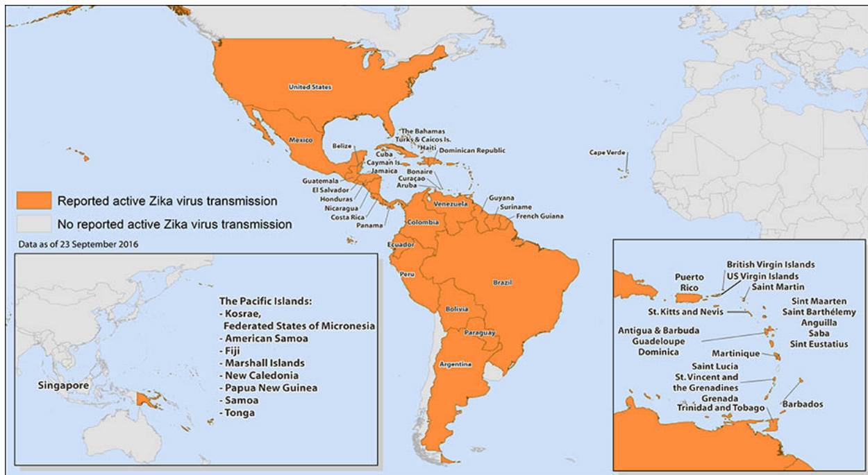
Figure 1. Zika virus spread worldwide and in the Americas. Centers for Disease Control and Prevention, (Updated October 7, 2016).