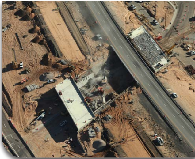
Overhead view of south bridge demolition

The design and construction of the bridges and the slide required detailed planning and design. Bridge construction began in mid-November 2011 with construction of the replacement bridges occurring at a location parallel to the current structures. The plan called for construction to include the use of precast concrete girders and partial-depth deck panels to accelerate construction along with slide-in bridge construction. The approach slabs were built on temporary false work and moved along with the rest of the superstructure. By early January 2012, necessary bridge construction elements were pushed 60 feet into position on two separate 56-hour moves: one on the I-15 southbound lanes on January 10, and the other on the I-15 northbound lanes on January 24.