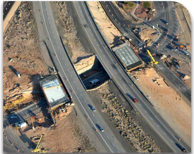
Overhead view of parallel bridge construction