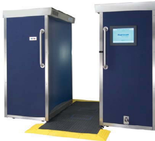
Figure 1. Backscatter Unit

TSA’s Passenger Screening Program manages security technology processes for passenger screening at airport security checkpoints to prevent the entry of dangerous and prohibited items on commercial aircraft. Advanced Imaging Technology (AIT) equipment is used to screen passengers for metallic and nonmetallic threats that include weapons, explosives, and other prohibited objects concealed on individuals entering secure areas of the airport. The general-use backscatter unit shown in figure 1 is one type of AIT equipment used for passenger screening. 1