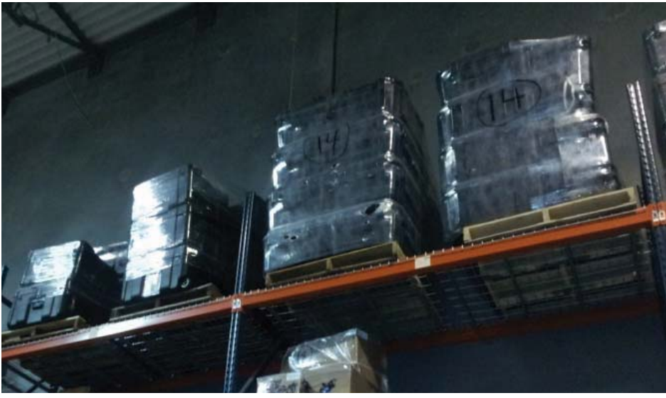
Exhibit 1. Empty ETD Cases

sent the empty cases to the warehouse for storage. Some of the empty cases were stored in the warehouse for almost 5 years. To optimize existing warehouse space, TSA could have recycled or removed the cases from inventory.