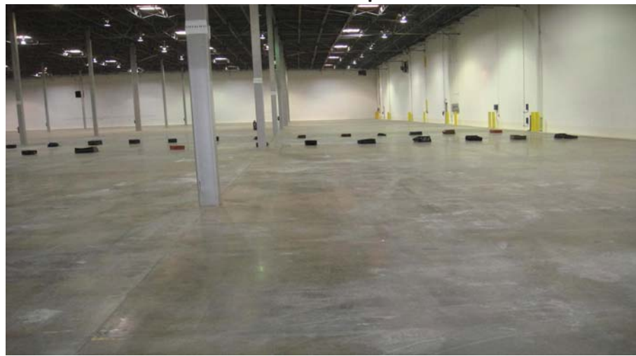
Exhibit 2. Warehouse 2 Unused Floor Space

TSA did not use all storage space within the Logistics Center. According to an April 2012 TSA report of Logistics Center space usage, TSA did not use all available floor and shelf space at the three facilities. Specifically, TSA did not use 72,074 square feet (about 16 percent) of the approximately 440,000 square feet of floor space. TSA was paying for unused space that equates to an area larger than a football field. Exhibit 2 shows the empty floor space in Logistics Center 2. According to TSA, the component used the empty floor space as a training area for its canine handlers. TSA officials explained that the component will not renew the warehouse lease when it expires in January 2013. In September 2012, TSA notified the warehouse owner that it did not intend to renew the lease; however, TSA could not provide us with documentation of a formal, approved plan for its future warehousing needs.