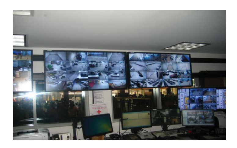
Figure 12- Views of CBP Surveillance Monitoring

OFFICE OF INSPECTOR GENERAL Department of Homeland Security