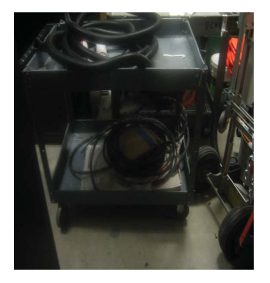
Figure 4 -Unlocked Communication Cabinet with Unsecured TSA Equipment