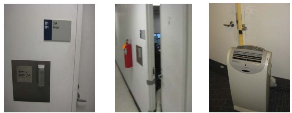
Figure 3a-Access Control Figure 3b-Unsecured Door Figure 3c-Climate Control

According to DHS Sensitive System Policy Directive 4300A: