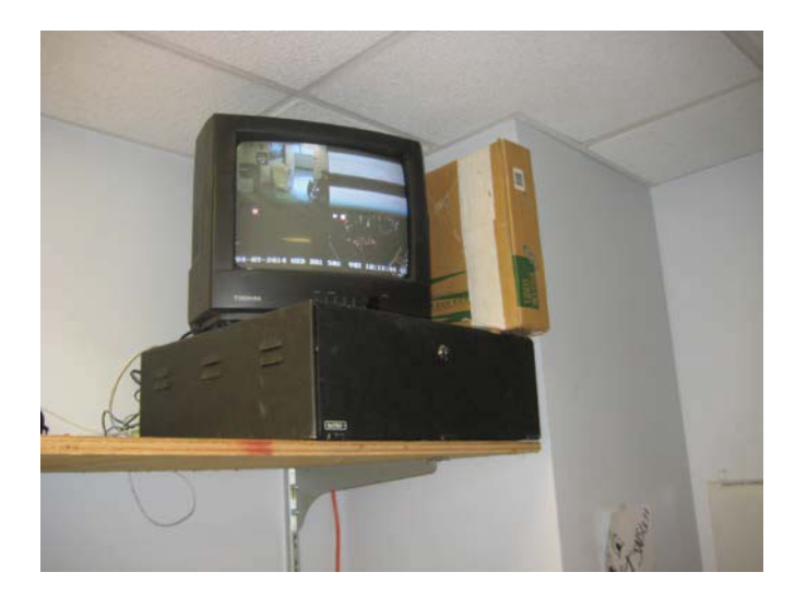
Figure 13- ICE's Surveillance Monitor

ICE's implementation of management controls over its CCTV cameras and surveillance systems for the physical security requirements at JFK did not conform fully to DHS policies. Specifically, in April 2010, ICE acquired space at Terminal 4, JFK for the Joint Narcotics and Smuggling Unit. This space includes CCTV cameras, a surveillance monitor, and a digital video receiver. Figure 13 shows the ICE surveillance monitor.