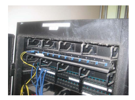
Figure 6- Dust covered Sensitive Equipment

Items being stored in the room were an obstruction and preventing access to the TSA IT equipment cabinets. A lack of housekeeping and maintenance caused a buildup of dust on TSA IT hardware stored within cabinets as shown in figure 6.