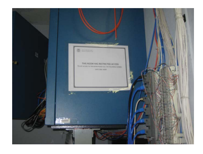
Figure 10- Unlocked Switch Box

CBP did not have a large enough box in the office storage area to contain one of its telecommunication switches. As a result, the box could not properly close. Figure 10 shows the box and the telecommunication switches mounted unprotected, beside the box.