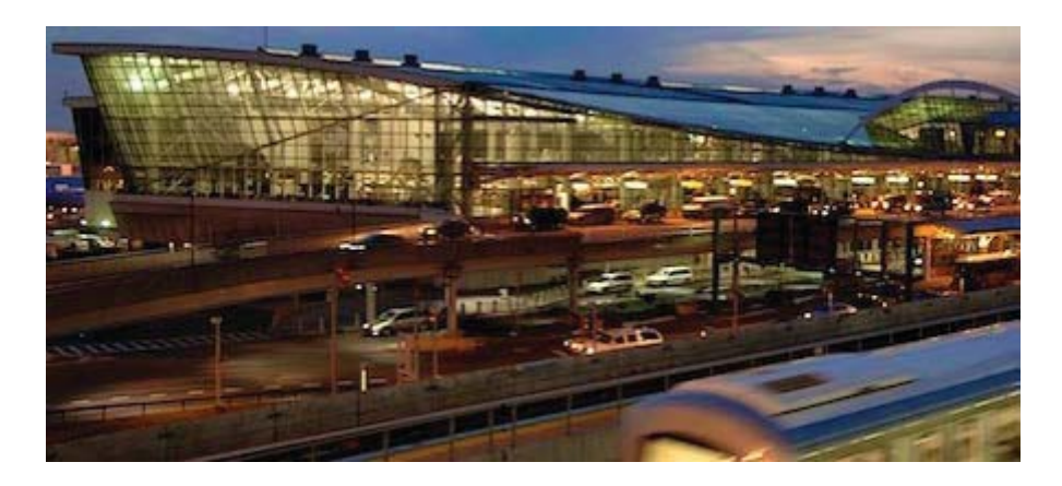
Figure 1-JFK Terminal Four

JFK is the sixth busiest airport in the United States. With arrivals and departures from almost every international airline in the world, JFK is an international gateway for passengers and heavy freight. Below are some facts about JFK.