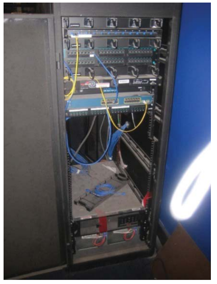
Figure 8-Inoperable UPS

A sensitive equipment cabinet located in a public area was unlocked and left open to run an extension cord to a nearby electrical outlet for power. Upon closer inspection, we determined that the UPS was inoperable and not being used to provide backup power to IT equipment. Additionally, the attached extension cord prohibited the cabinet from closing and locking.