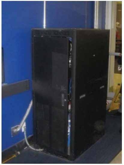
Figure 7-Accessible Equipment