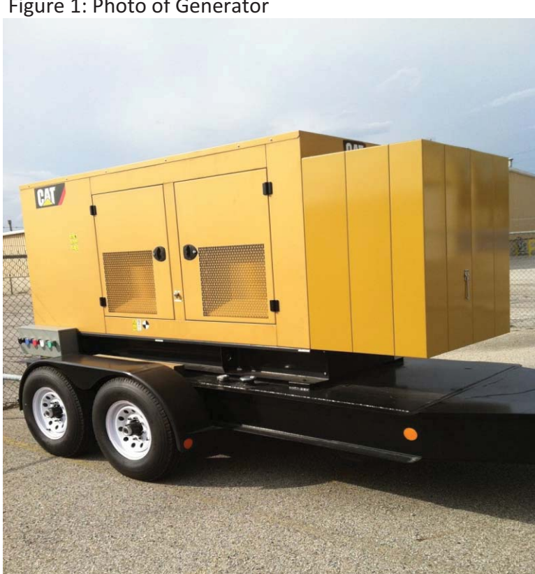
Figure 1: Photo of Generator