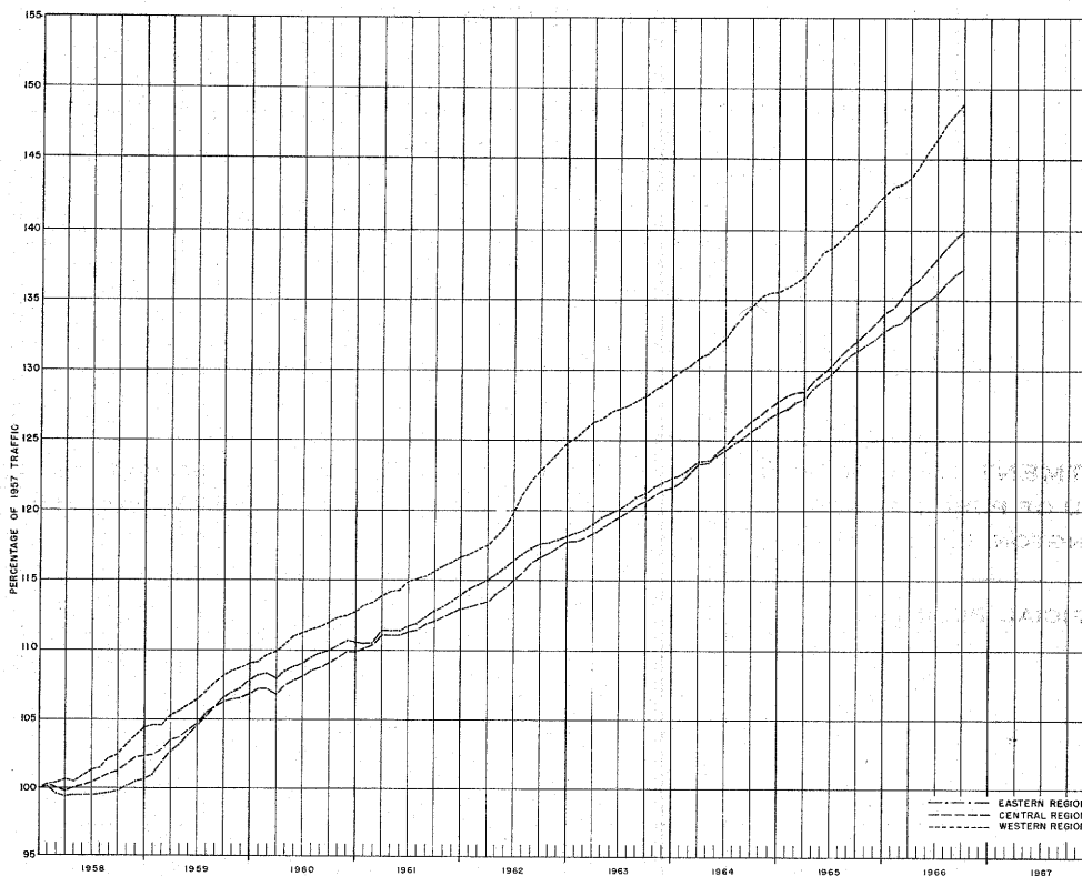
FIGURE 3--TRAVEL ON MAIN RURAL ROADS BY 12-MONTH PERIODS ENDING EACH MONTH, AS PERCENTAGE OF TRAFFIC IN THE CALENDAR YEAR 1957