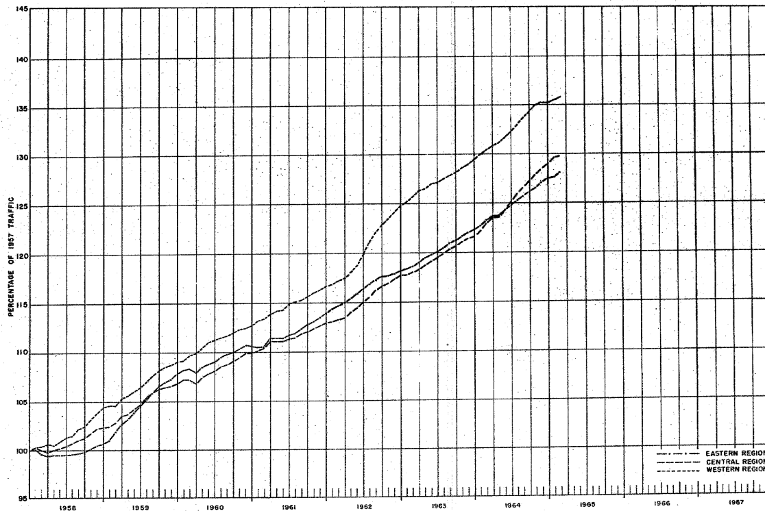
FIGURE 3—TRAVEL ON MAIN RURAL ROADS BY 12-MONTH PERIODS ENDING EACH MONTH, AS PERCENTAGE OF TRAFFIC IN THE CALENDAR YEAR 1957