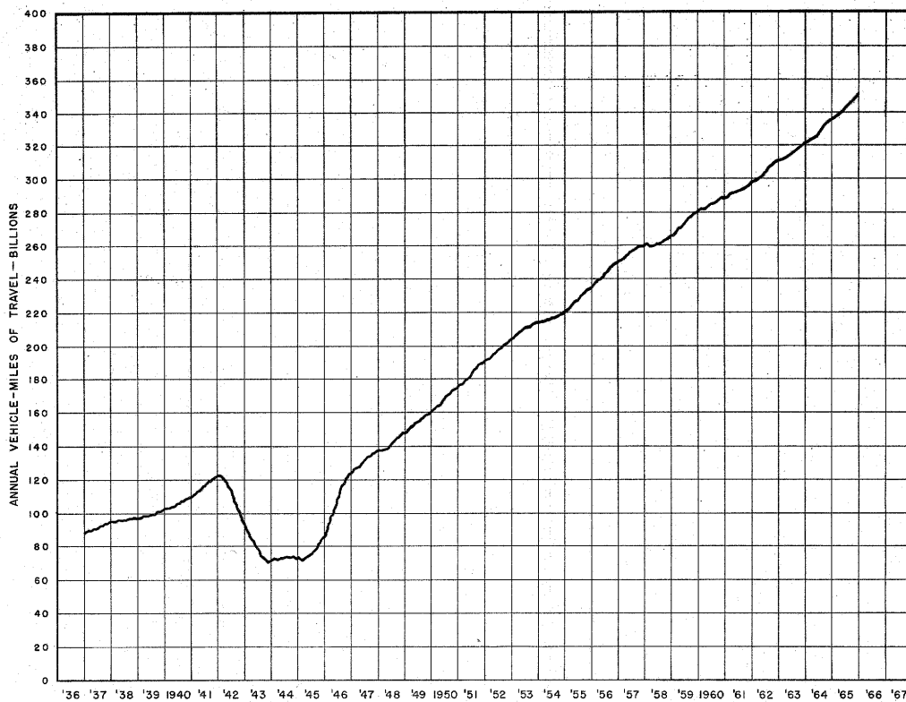
FIGURE 2--TRAVEL ON MAIN RURAL ROADS BY 12-MONTH PERIODS ENDING EACH MONTH, IN VEHICLE-MILES